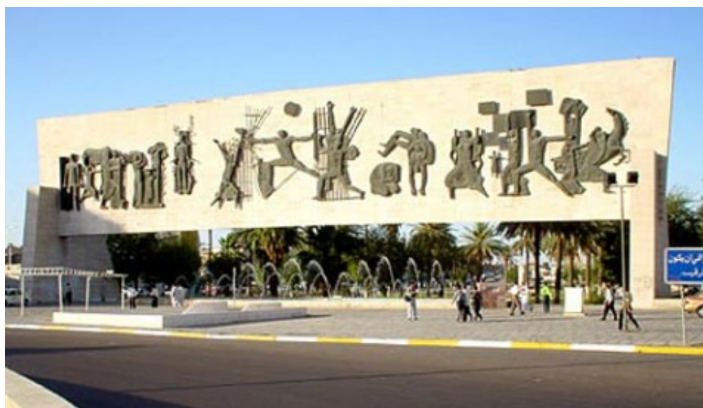
The "Epic of Liberty" monument over Baghdad's Tahrir Square. Undated pre-2003 photo.