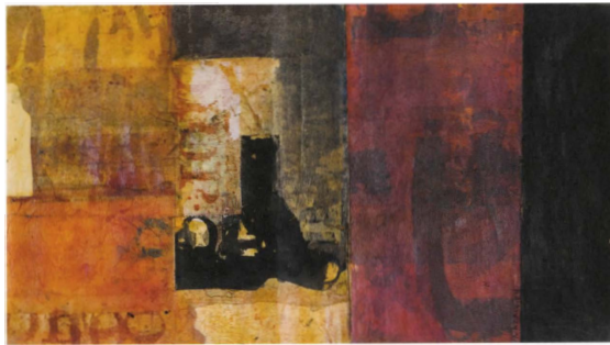
Untitled, 2004 Mixed media on paper, 66 x 113 cm