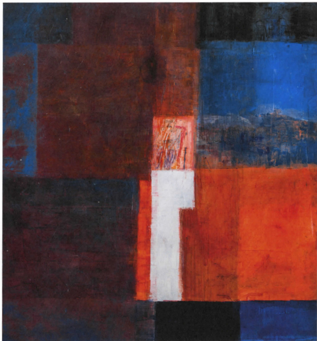
Untitled, 2003 Acrylic on canvas, 76 x 70 cm