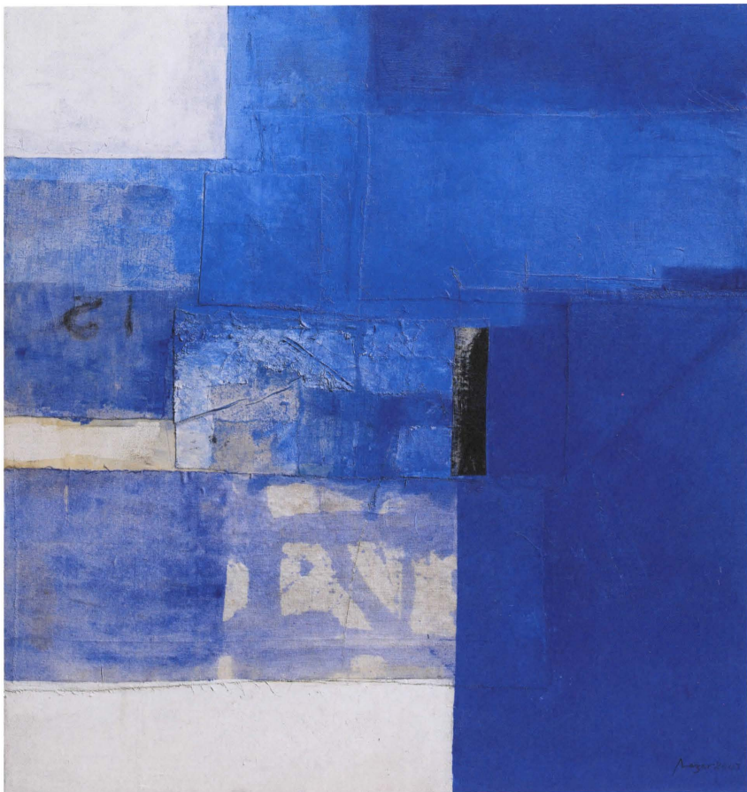
Untitled, 2003 Acrylic on canvas 76 x 70 cm

"Through my artistic work, I try to investigate the answers provoked by my personal confrontation with a changing world; the antiquated remains of war, wandering from one country to another, accepting expatriation finally as a late psychological outlet. These changes and the windows they opened as regards information and experience were positively reflected in my artistic work and its relation to personal pain. Shapes that are taken from reality have symbolic meanings that become more effective and inspiring when seen in relation to other shapes, and lend them a motive for the imagination. Loaded with a power that emulates the language of Sufi poetry and verse in its approach, a path is opened to wide channels of knowledge that tempt the recipient to become an important player in this space. Such concepts, by which I orchestrate the natural shapes with perceptions that surround us in our daily lives, are what achieve the 'shock' I aspire to. A shock that leads to the creation of a new vision with clear symbolic renderings that are evident in the varying Islamic and Arabic literary and scientific scripts, which have a creative presence in the building of my art work."