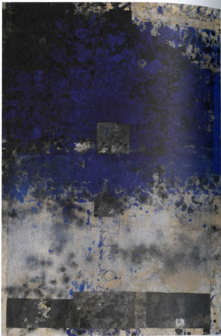
Untitled, 2004 Acrylic on canvas, 90 x 60 cm