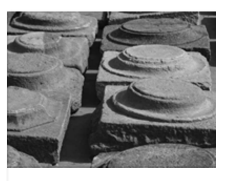
Ai Weiwei Exhibits Fon