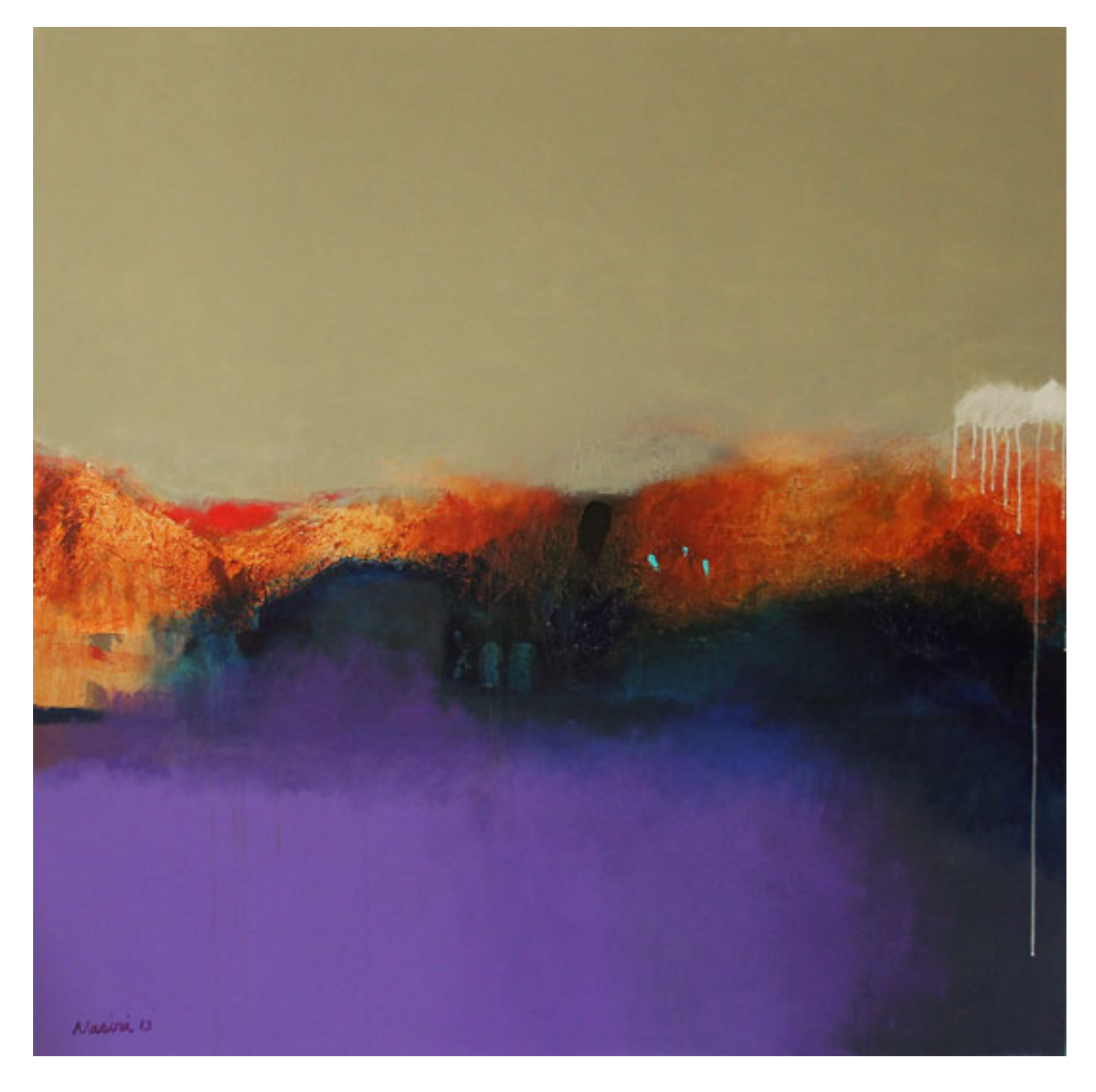
Rafa Al Nasiri. Beside the River, 2013, acrylic on canvas, 150 x 150 cm

An exhibition that provides a thorough overview of the artist's universe – extending from Iraq to Europe via China.