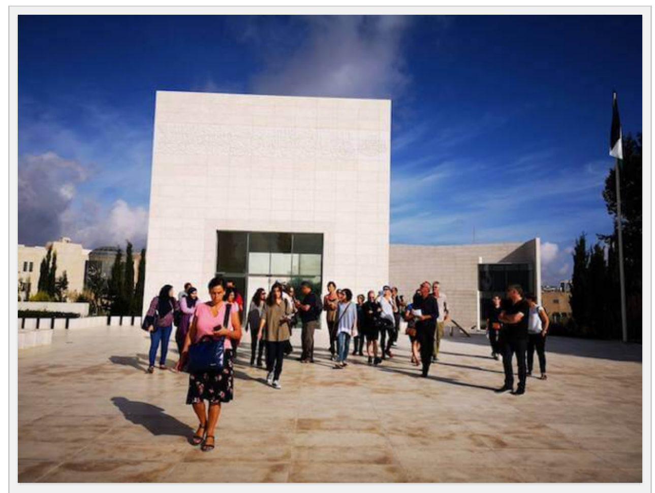
Riwaq's Ramallah Urban Tour as part of "(ONE)H: Clustering, Reciprocity and Interdependency".

Riwaq's ongoing work attempts to accelerate restoration, to maximise the benefits of local communities and combat the embedded colonial processes at heritage sites. Instead of focusing on individual villages or towns, Riwaq will conduct a series of 'urban tours' through village clusters, tackling them as one entity.