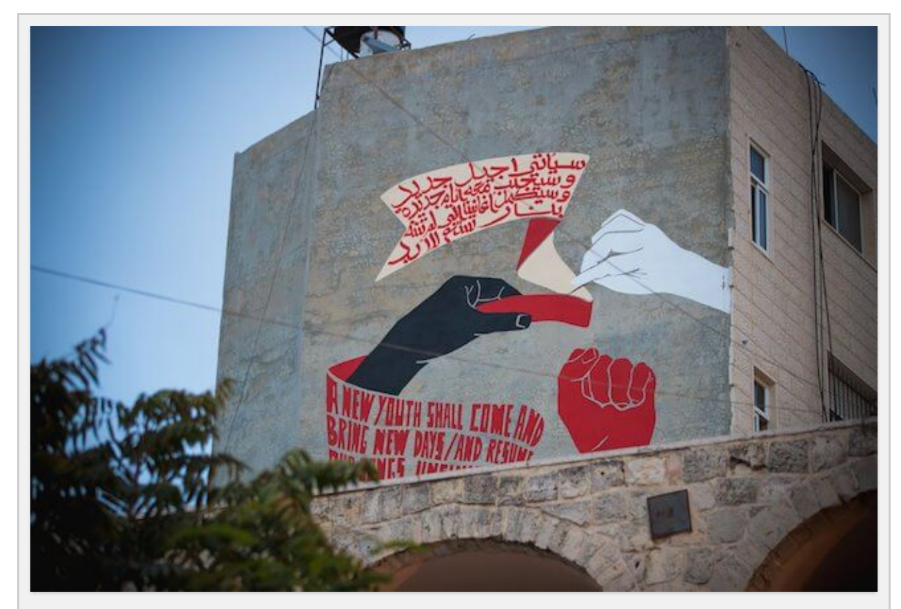
Kurs, 'What Do We Know About Solidarity', 2018. Commissioned by Ramallah municipality.

On view in various locations until 30 October 2018, the biennial aims to re-energise and re-investigate concepts of community and collectivism.