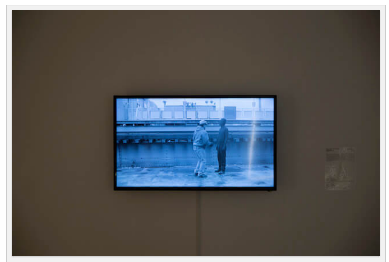
Noor Abed, 'Out of Joint', 2018, video, in "Interlude" hosted by The Palestinian Art Court – Al Hoash.

Taysir Batniji 's piece Wallpaper is also prominently featured in "Interlude", consisting of collected images and internet screenshots that form broad wallpaper patterns. The artist's chosen imagery ranges from bits that are widely recognisable and those that are anxiety-inducing or horrifying. We see sites of bombings, weapons of war and violent arrest scenes that have become, for many, the physical setting of daily happenings. Batniji argues that the use of wallpaper neutralise these images, domesticates them: