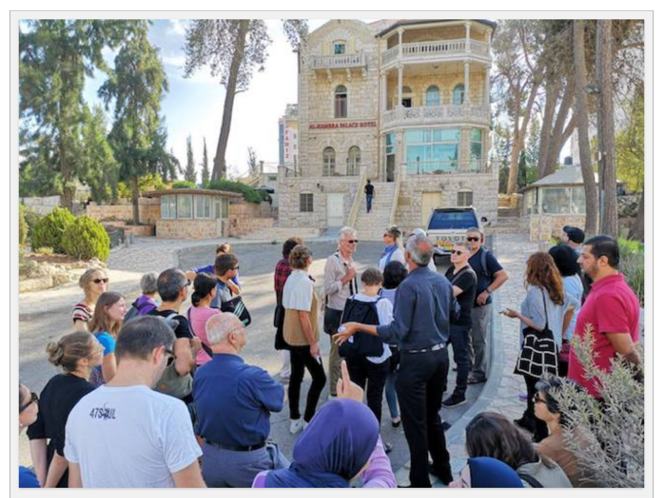
Riwaq's Ramallah Urban Tour as part of "(ONE)H: Clustering, Reciprocity and Interdependency".