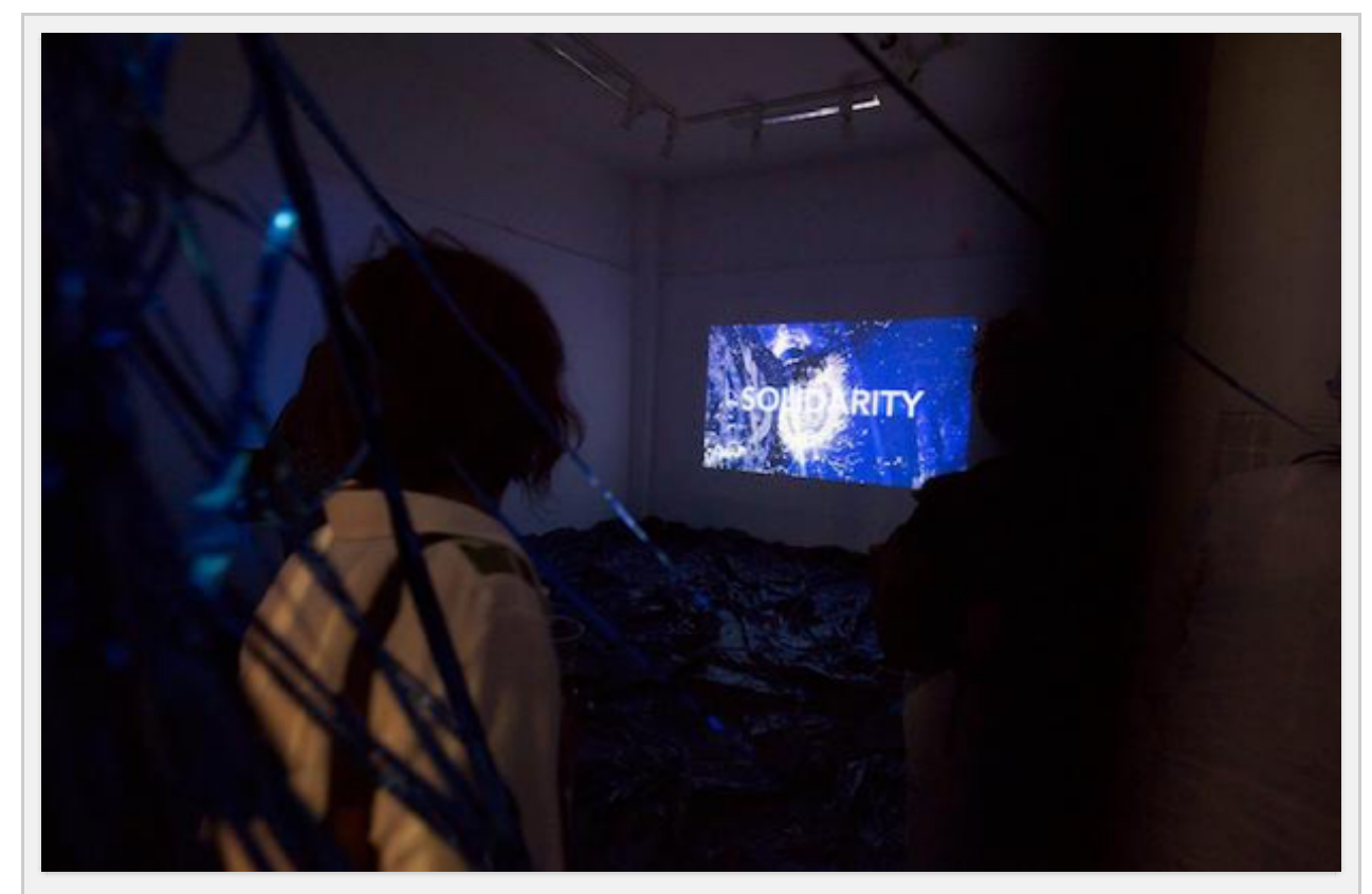
Tom Bogaert, 'Observance', 2018, video installation as part of the opening of "Interlude" hosted by The Palestinian Art Court – Al Hoash.

The Qalandiya International (QI) masquerades as one of these biennials, these elitist exhibitionary megaliths, but is, in reality, far from it. The name 'Qalandiya' does not signify a globally renowned city, and its immediate locale is a troubled one. It speaks to all occupied Palestinian territories, the West Bank, Judea and Samaria (depending on who is doing the naming) and Qalandiya itself, which is typically associated with the military checkpoint operated by the Israel Defence Forces (IDF). A site of frequent clashes between Israeli soldiers and Palestinians, the Qalandiya checkpoint is one of the main points of entry into or out of the occupied West Bank. Yet 'Qalandiya' as a city, site and art space has other connotations that have been blurred or erased. It recalls the closed and abandoned Jerusalem airport; it is also the site of the Qalandiya refugee camp, and the village of Qalandiya now divided by the separation wall. A meeting place of contradictions, it is now a place, and symbol, of disconnection, isolation, segregation and fragmentation.