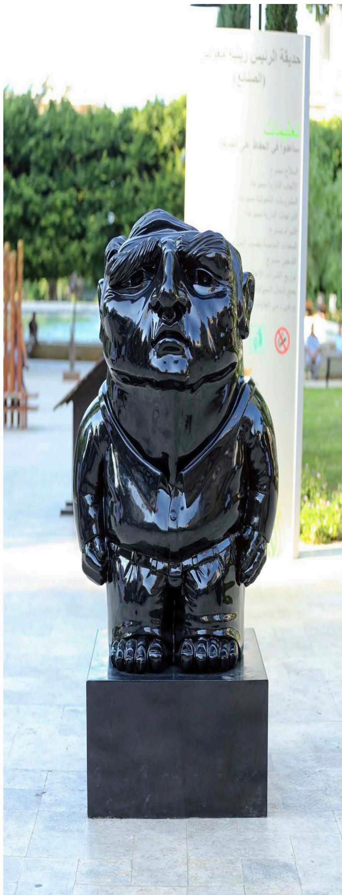
"Citizen zero" by Houmam Al Sayed