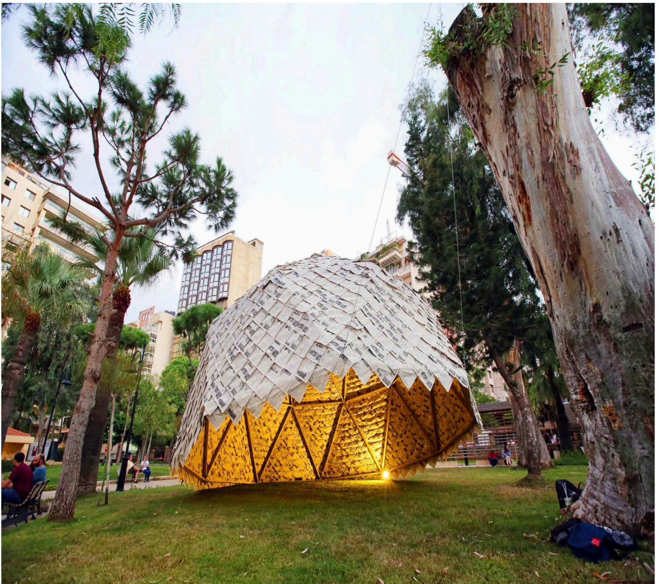
"Dôme" by Yok Yok

To the right, hangs a dome made out of newspaper made by Atelier Yok Yok (France), an item many Lebanese have grown knowing and seeing every morning, discovering it as a child and referring to it as an adult. The newspaper was the source for Lebanon's tortures: the bombs, the massacres, the martyrs. However, it was also the teller of victories and achievements. The dome, possible reminiscent of the egg in Beirut's down town, shows the light living of the everyday Lebanese, regardless of the hard realities they carry.