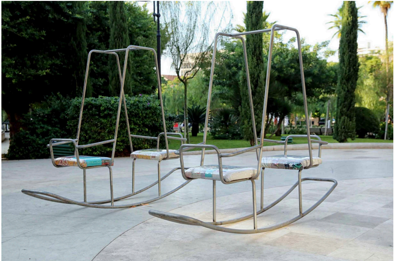
"Swing me" by Bokja Design

This resistance is represented by the swings ("Swing me" by local Bokja Design in 2016), both aesthetic but practical, depicting the beauty of being a child in Beirut and riding a bicycle around the nearby garden, notwithstanding the lack of sleep this child has suffered due to the sound of bombings.