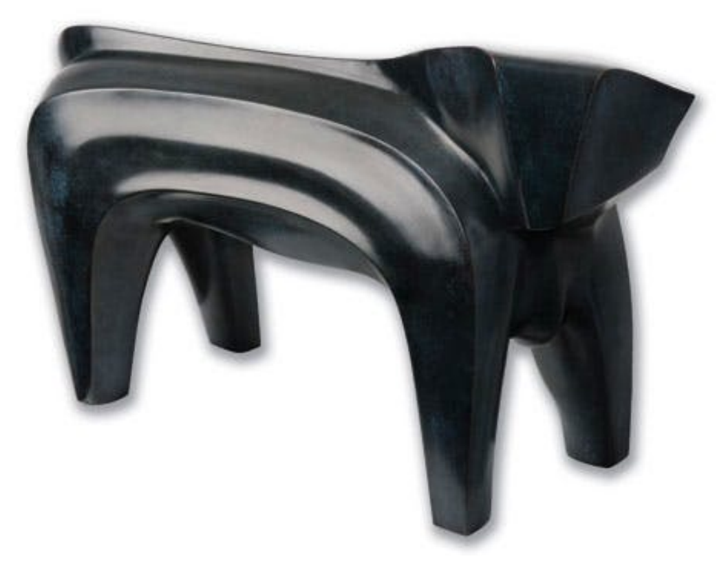
Taureau (2003), Alfred Basbous. Courtesy the artist and Sophia Contemporary Gallery