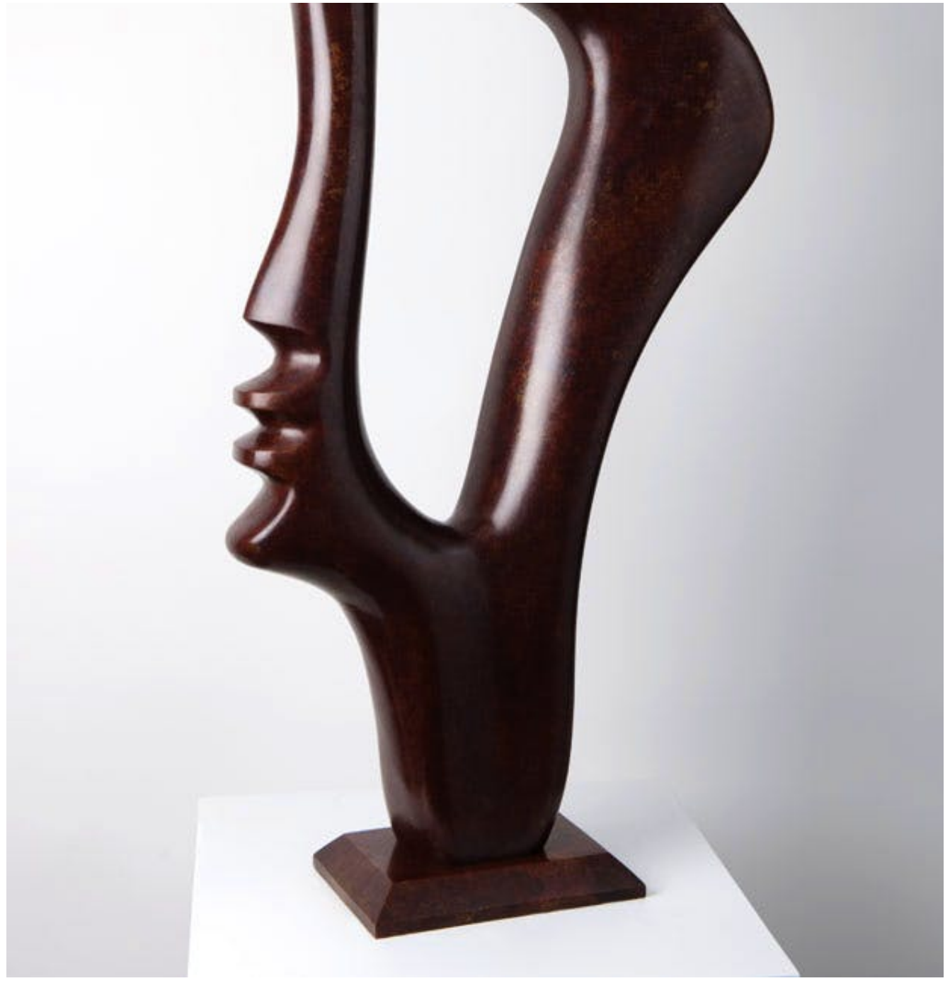
Profile (2004), Alfred Basbous.

Syrene (1985), an elegantly cubism-inflected female figure, contorted around a similar aperture and seemingly caught between two forms – human and avian – looks as if it could have been made at the same time. Basbous would often revisit and remake certain works decades later, in different materials and sizes. It seems as though, rather than evolving in phases throughout his career, his motifs have existed forever: or at least, the show is cleverly framed