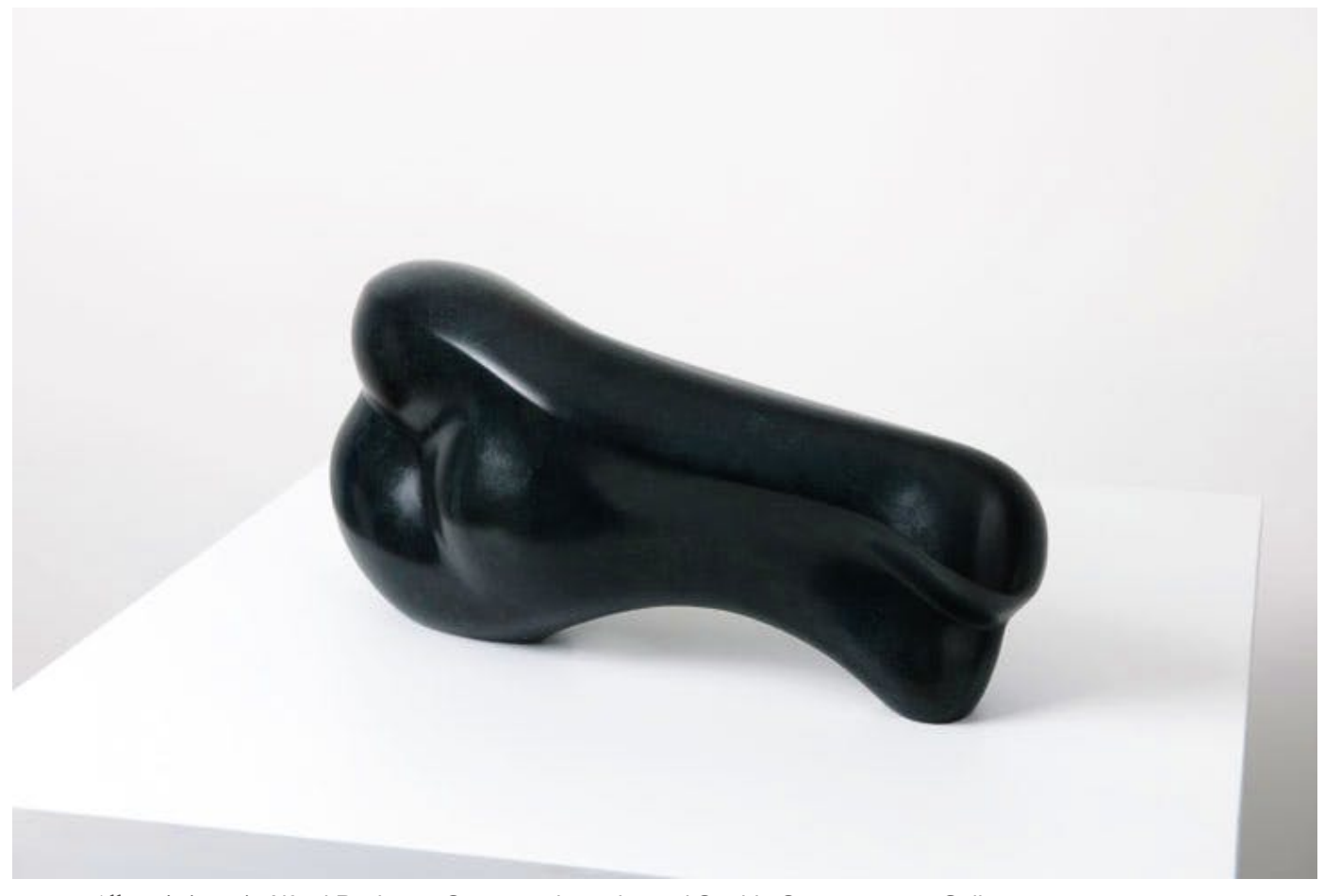
Femme Allongée (1985), Alfred Basbous.

siblings, turn his hometown of Rachana into an <u>open-air sculpture park</u>. It is now a UNESCO site, and he is one of Lebanon's most celebrated modern artists.