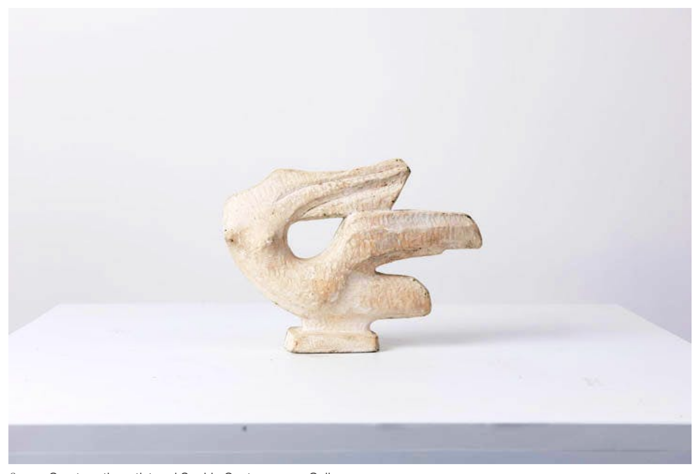
Syrene

to emphasise his importance as a fully-formed talent for the majority of his career.