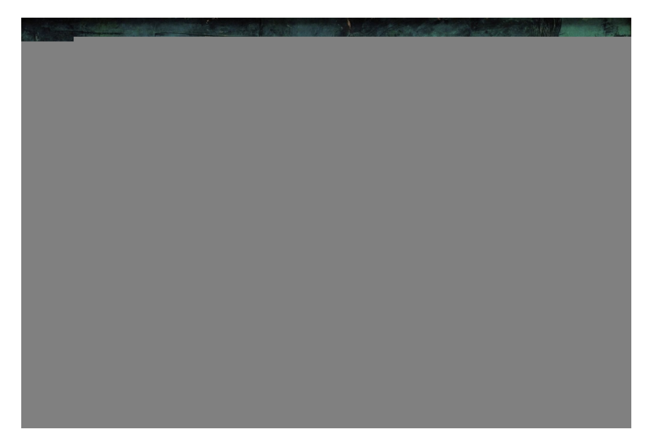
The Light from Within the Green (1958), by Abdel Hadi el-Gazzar, a pioneer of Egyptian modern art.

There are clear markers of the artists' own sociopolitical and national locality in the works on display, and of the exchange and dialogue that happened between the various Arab states as artists studied in art schools in different neighboring countries and under the tutelage of different teachers.