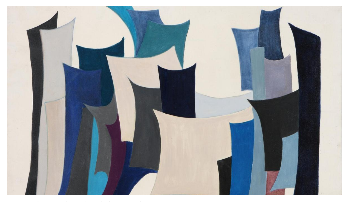
Huguette Caland's 'City II' (1968), Courtesy of Barjeel Art Foundation

Featuring more than 80 works from the foundation's collection, the exhibition will be shown in five US cities until 2021