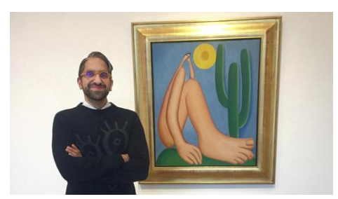
Sultan Sooud Al Qassemi on 'male chauvinism' in art: 'Women represent women better'

Eye on Ethiopia: film festival in Sharjah offers insight into the country's political and cultural life