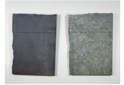
Giovanni Anselmo Senza titolo (Untitled), 1990 Africa black granite sheet, canvas on loom and stainless steel cable noose with clamp 200 x 140 x 6.5 cm acquired by Fondazione Guido ed Ettore De Fornaris from Alda Sassi, Turin, 1996 Fondazione Guido ed Ettore De Fornaris GAM – Galleria Civica d'Arte Moderna e Contemporanea, Turin Courtesy Fondazione Torino Musei Photo: Studio Fotografico Gonella

Giovanni Anselmo Senza titolo (Untitled), 1990 Aosta green granite sheet, canvas on loom and stainless steel cable noose with clamp 200 x 140 x 6.5 cm acquired by Fondazione Guido ed Ettore De Fornaris from Alda Sassi, Turin, 1996 Fondazione Guido ed Ettore De Fornaris GAM – Galleria Civica d'Arte Moderna e Contemporanea, Turin Courtesy Fondazione Torino Musei Photo: Studio Fotografico Gonella