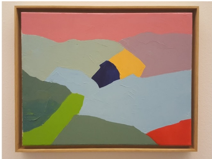
Etel Adnan - Untitled, 2012, Oil on canvas

Many of the forms and compositions that appear in Adnan's abstract paintings are informed by the visual landscape of the places she's lived. She spent much of the last five decades living north of San Francisco, surrounded by the Marin Headlands, Mt. Tamalpais and the Bay. The echo of mountains, sky, sea and encroaching human habitats offers a definite starting point for understanding Adnan's imagery. But her intuitive ability to reduce that figurative world into something more universal gives way to a far more transcendent aesthetic language composed of color fields and geometric forms. Her abstractions are less related to external nature and more closely aligned with something internal.