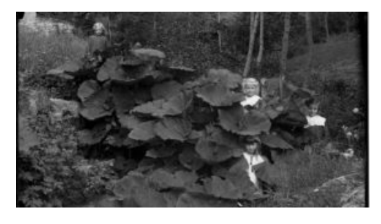
EXHIBITION - ALL AGES