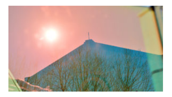
EXHIBITION - ALL AGES

COVID-19 | The Fondation reopens on June 27 with a new exhibition!