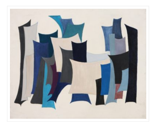
Huguette Caland (Lebanon), City II, 1968, oil on canvas, 31 \frac{1}{2} \times 39 \frac{3}{8} in., Collection of the Barjeel Art Foundation, Sharjah, UAE

"The Grey Art Gallery takes great pride in partnering with the Barjeel Art Foundation," says Gumpert. "It is very appropriate that, as a university museum, the Grey broadens vistas and looks closely at art made over the four decades in question by individuals that come from so many different nations, with different belief systems and histories. We chose an