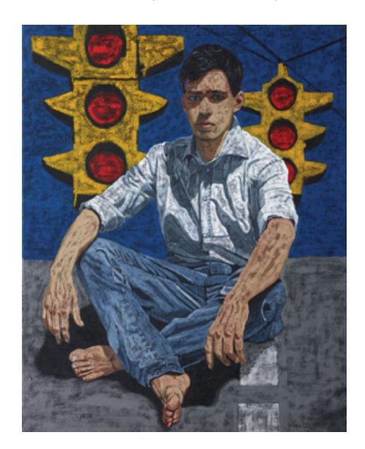
On the Road II, (Jack Kerouak, 1957), Oil on canvas, 100 x 80 cm, 2017

impact that brings them into a new era and locality, ultimately emphasising the universality of their themes, hinging on concepts such as youth, innocence, death and freedom.