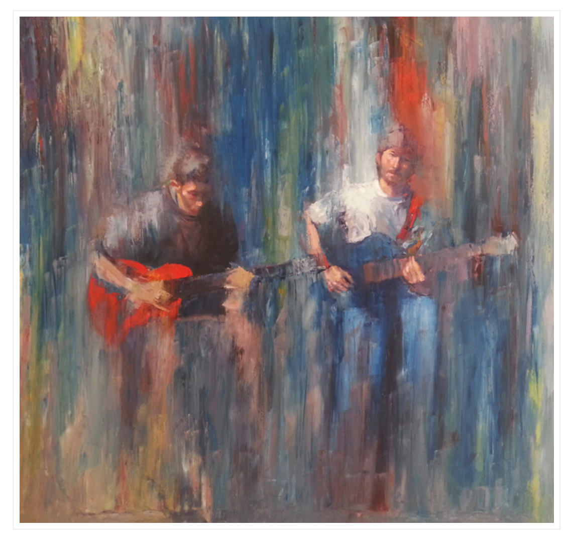
Artwork by Ghassan Abu Laban

Orient Gallery at AWA 2013: Colorful Thoughts