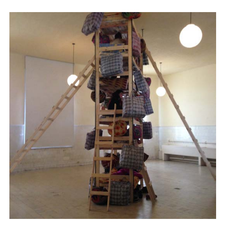
Fig. 3: Barthélémy Toguo, Climbing Down, 2015, Bunks, hand ladders, multi-colored bags, activated by students from the UNTREF Circus arts program. 500 x 180 x 100 cm. (MUNTREF), Centro de Arte Contemporáneo, located at the site of the former Hotel de Inmigrantes, Buenos Aires, 2015.

The flanking galleries display photographs as well as object-based and film installations. The implicit inaccessibility and violence of border crossings in its various forms resonates strongly here, as with Claudia Caserino's 2008 piece, Uniforme , stressing the socio-economic barriers faced by migrants. Nearby, Sigalit Landau's Barbed Hula video documents the physical scarring produced by the artist's performance of a hula dance with a hoop of barbed wire— a visual commentary on the desensitization of contemporary society to state-sponsored migrant oppression.