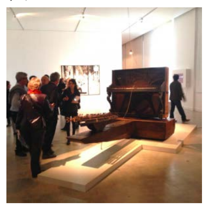
Fig. 2: Hugo Aveta, Océano, 2015, Sound installation. 506 x 240 cm. (MUNTREF), Centro de Arte Contemporáneo, located at the site of the former Hotel de Inmigrantes, Buenos Aires, 2015.

As the backdrop of the exhibit's inaugural ceremony in the central hall uniting all MUNTREF galleries, the work of Cameroon artist Barthélémy Toguo garnered particular attention. Titled, "Climbing Down," the piece invited the collaboration of students from the Universidad Nacional Tres de Febrero's Circus Arts program, who interacted within a towering woodenframe bunk beds decorated with bundles of traditional African cloth, representative of the personal belongings of immigrants. The work was intended to reflect the precarious reality of life for African migrants in Paris today.