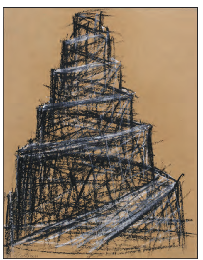
WALID SITI, Untitled, 2001.

Western, British Museum visitors may not feel familiar.