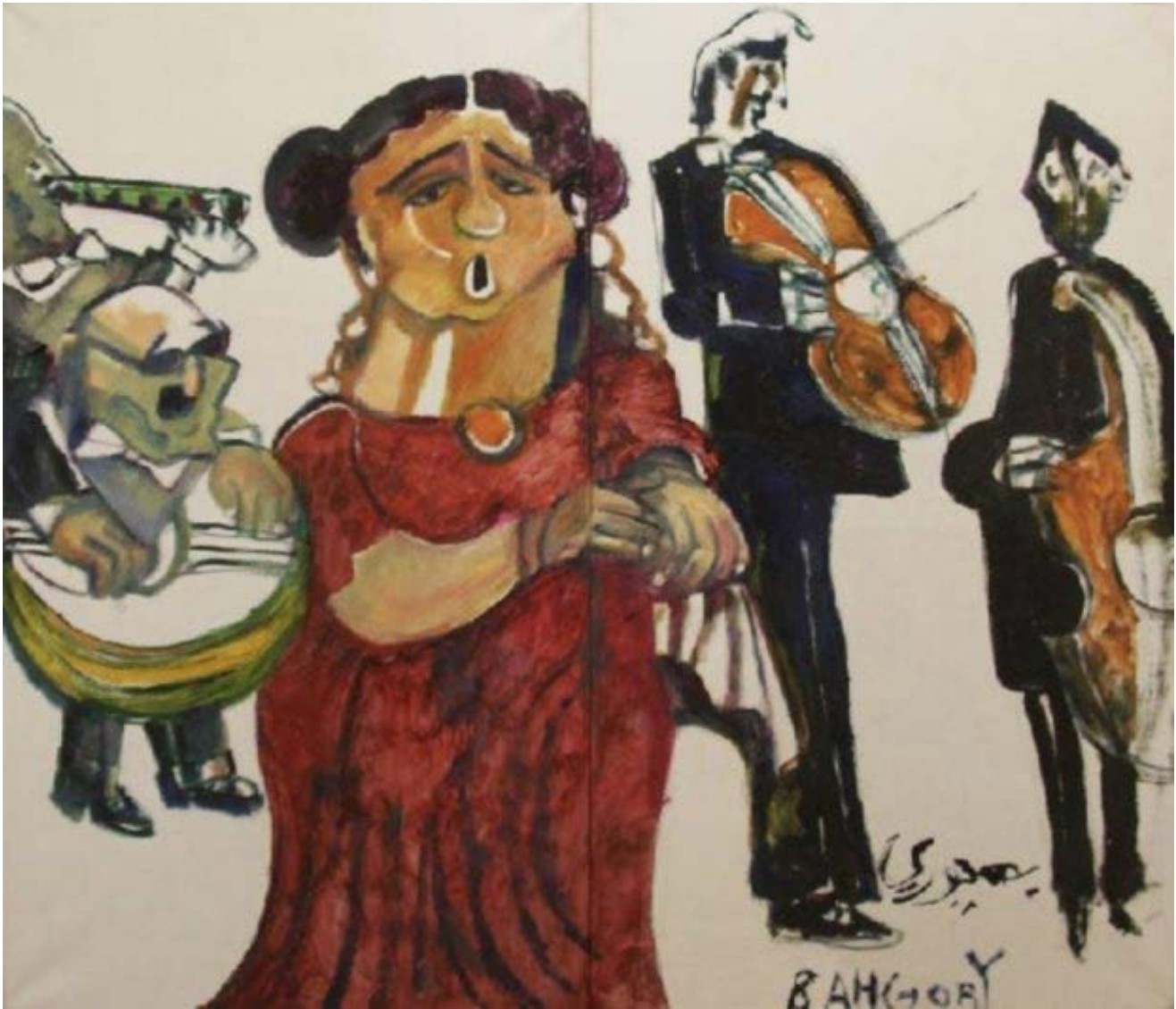
Um Kulthum painting by George Bakhour.

As you look on, you suddenly realize that you are not in a concert hall but might actually be in a modern-day party. There are handsome brush strokes of disco lights such raw energy and vibrancy that catapult the gazer to a party in which you cannot leave.