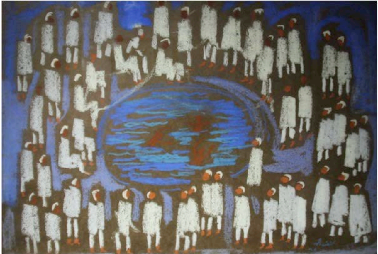
Painting by Refaat Ahmed

In the main gallery, there is also an earthy-tone painting of a good-looking horseman performing a wedding celebratory dressage dance, by Refaat Ahmed.