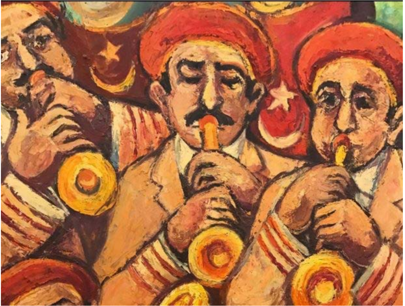
Painting by Fathy Afifi

When you walk into the gallery, you are immediately greeted with a pair of Guirguis Lotfy creations. Lotfy is a highly admired contemporary Egyptian painter, whose artwork often depicts Japanese manga-ish Coptic figures and stylized treatment. The Alexandrian artist fashions the centuries-old technique of tempera painting for his work, utilizing beeswax, egg-yolk and gold leaf.