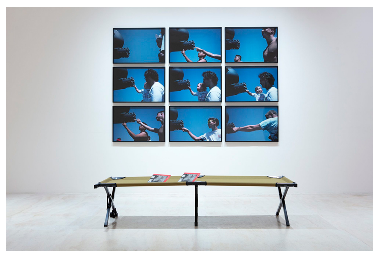
Allan Sekula, War Without Bodies, 1991/1996, installation view, 'Theater of Operations: The Gulf Wars 1991–2011', MoMA PS1, New York

carved up the Middle East after the fall of the Ottoman Empire. Yet, in recent years, increased interpersonal connections, transnational communications and tariff-free trade, coupled with governments ceding power and pooling decision-making capabilities, has prompted debate as to whether nations have lost sovereignty over their citizens. This has been extreme in Iraq, and is exemplified by the figure of Soleimani, who operated with impunity there, as well as in Lebanon, to install the Iranian presence via Shi'ite militias. Much of Iraq is now a proxy battleground between Iranian and US interests.