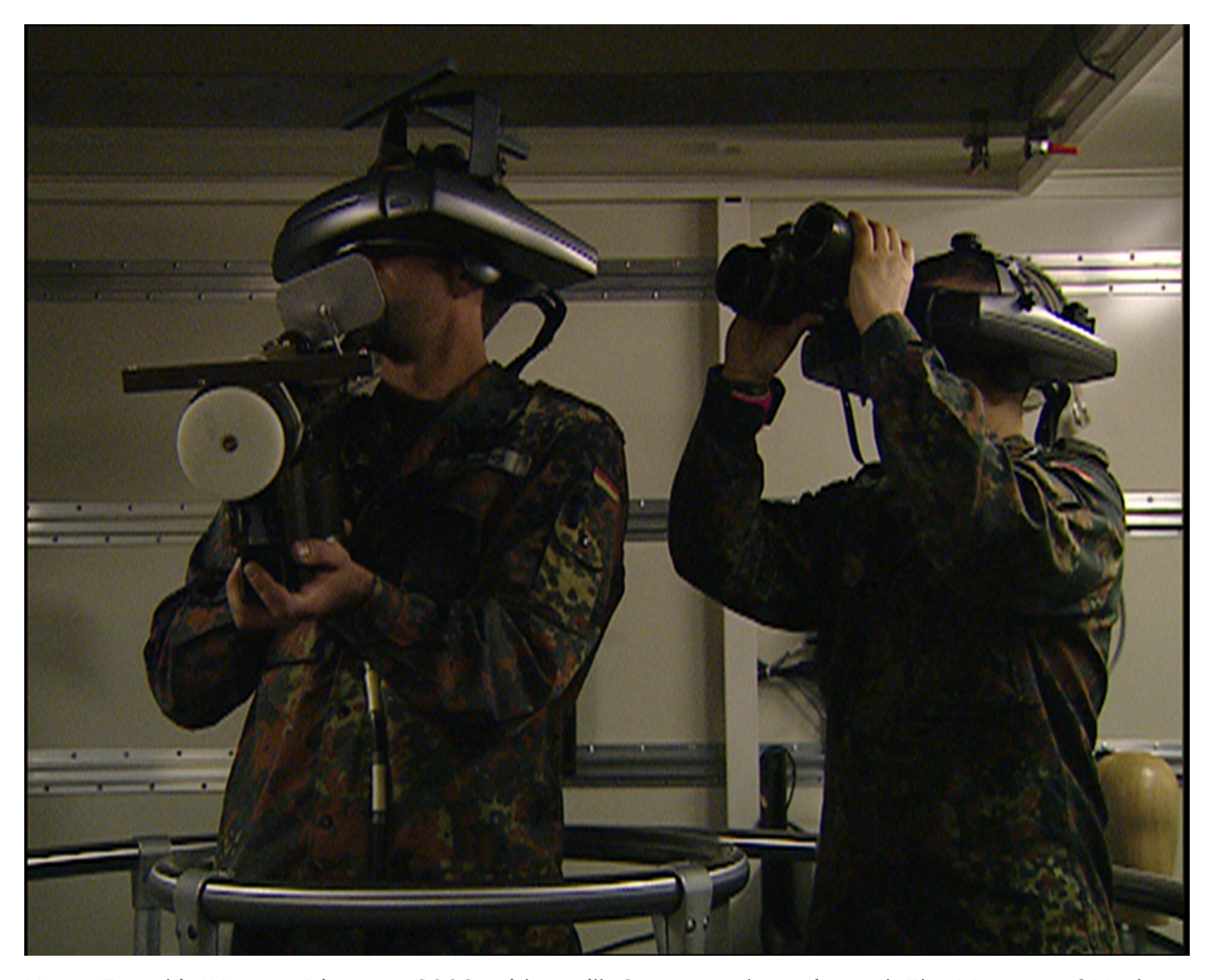
Harun Farocki, War at a Distance , 2003, video still. Courtesy: the artist and The Museum of Modern Art. Committee on Film Funds. © 2019 Harun Farocki Filmproduktion

region with the resurgence of the Islamic State in 2014. Private military contractors, mostly staffed by former servicemen, were also in Iraq throughout its civil war (2014–17). The potential conflict stirred up by the Soleimani drone strike isn't a new book; it's another chapter – hopefully the last – in a long-running story.