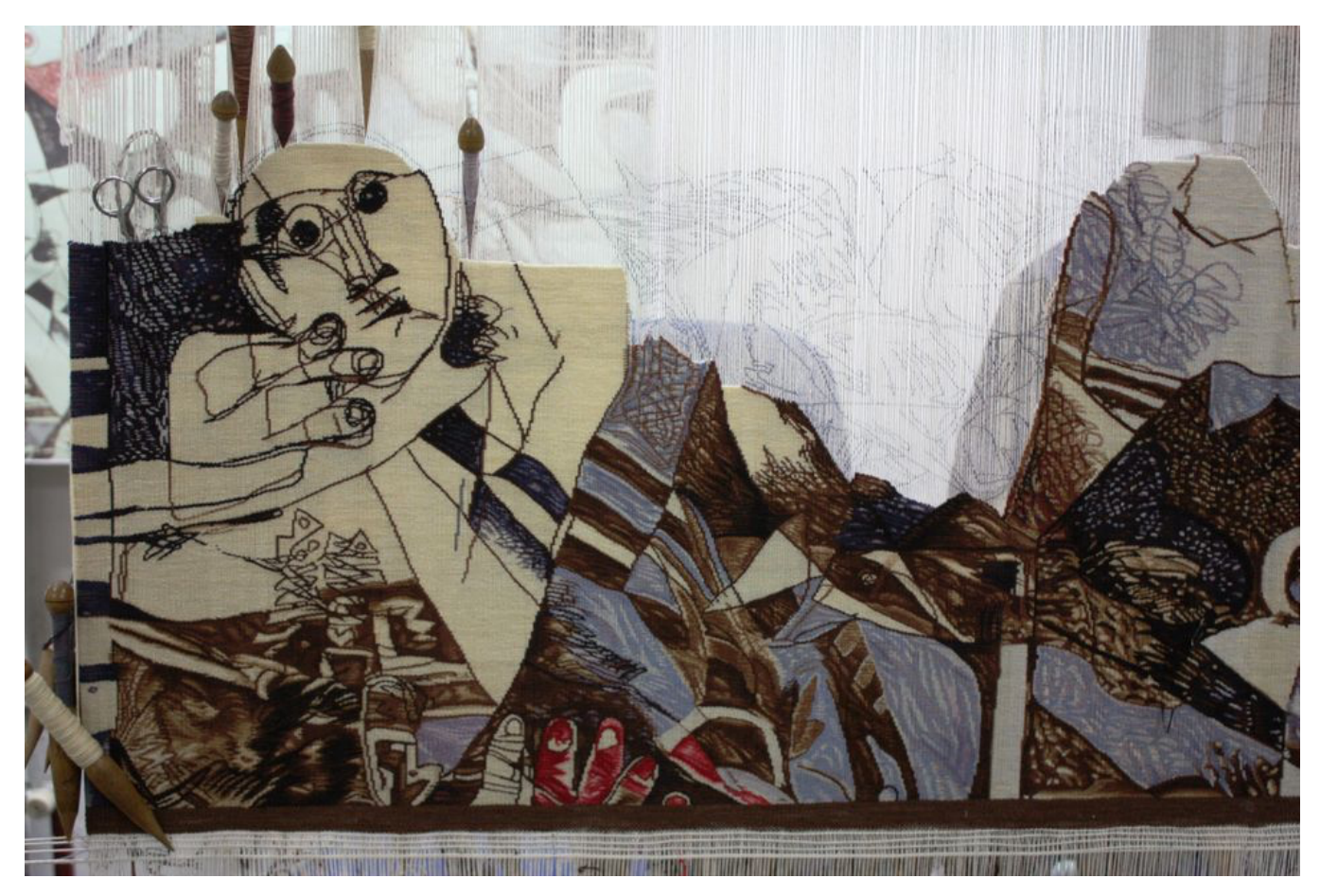
A detail of the weaving for Sabra and Shatila Massacre tapestry