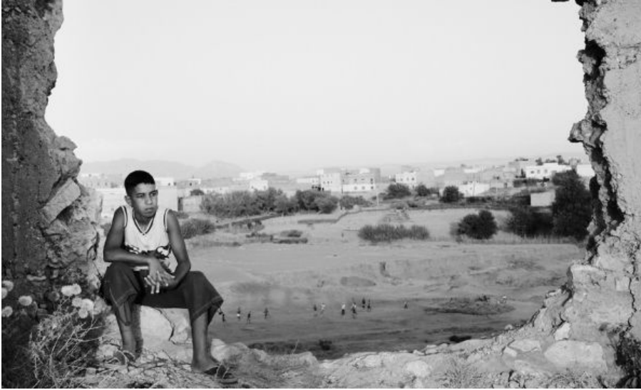
Pasara by Leila Alaoui, 2008.

Rite of Passage opens with the photographer's most celebrated series, Les Marocains (2010-14), which features life-sized portraits of some of the men, women, and children – from vastly different communities – whom she met during her travels across her home country of Morocco.