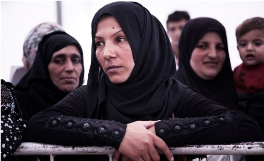
Waiting by Leila Alaoui, 2013.

The exhibition continues with works from Alaoui's first photographic series No Pasara (Entry Denied) , created in 2008. Commissioned by the European Union, the series follows young Moroccans who left the Moroccan port cities of Nador and Tangier, attempting to seek passage to Europe, but become stuck along the way.