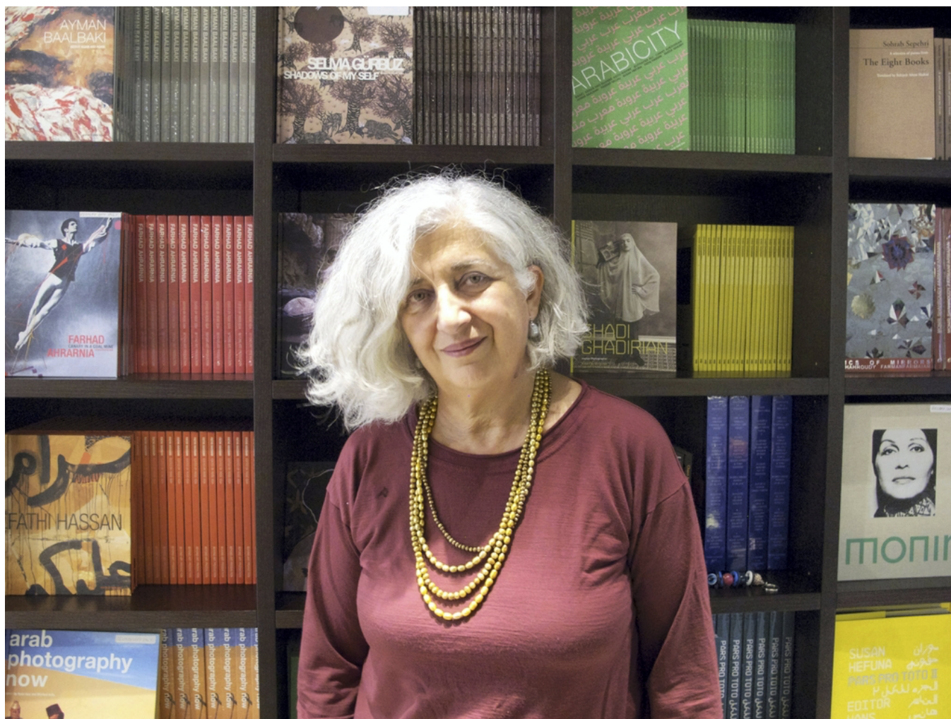
London-based writer and curator of Ourouba: The Eye of Lebanon.