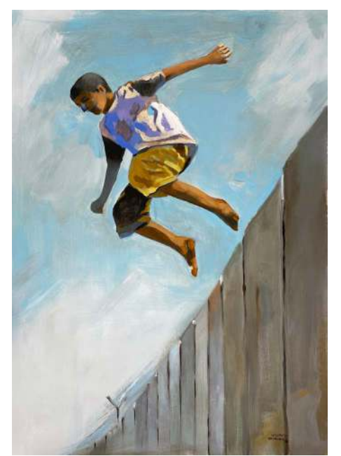
LEFT | HASAN (2020), OIL ON CANVAS, 122 X 87 CM CENTER | ZEINA (2020), ACRYLIC ON CANVAS, 122 X 87 CM RIGHT | RAKAN (2020), ACRYLIC ON CANVAS, 122 X 87 CM