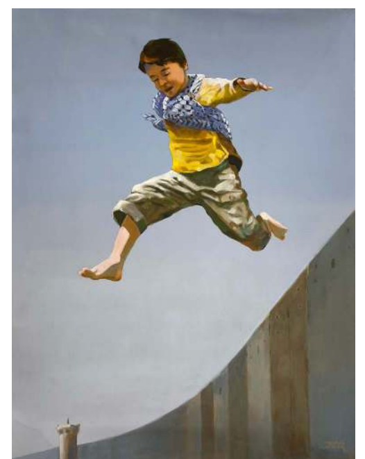
LEFT | NIDAL (2020), OIL ON CANVAS, 150 X 110 CM RIGHT | RIHAN (2020), ACRYLIC ON CANVAS, 167 X 125 CM