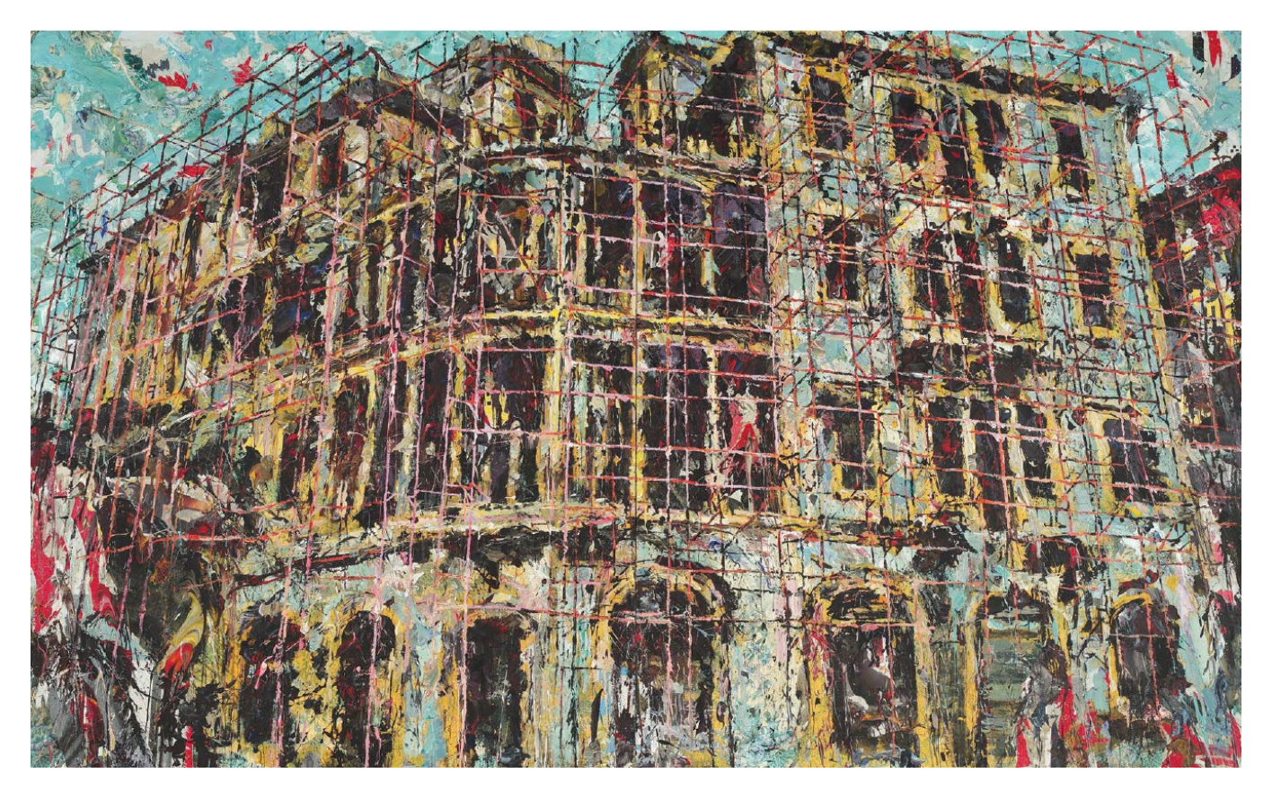
Ayman Baalbaki's "Barakat Building," 2015.