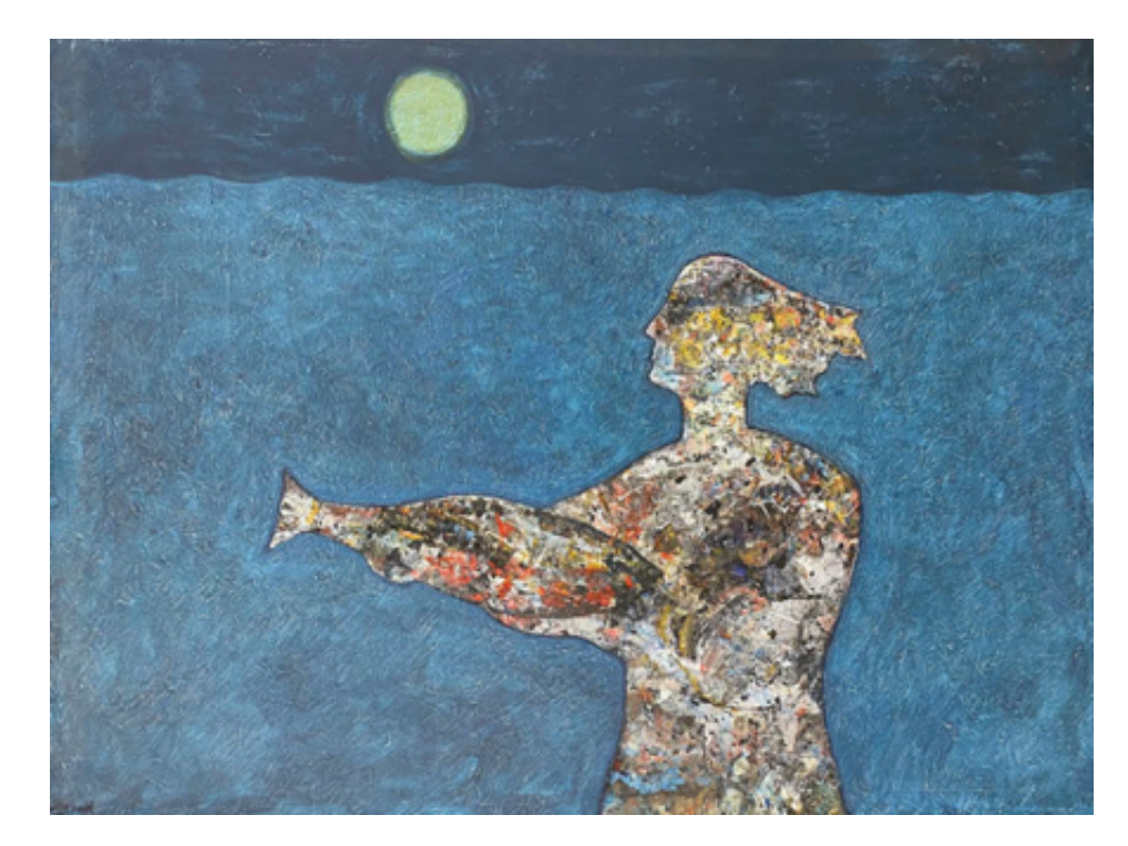
Survival #2 (2017), acrylic on canvas, 126 x 165 cm.