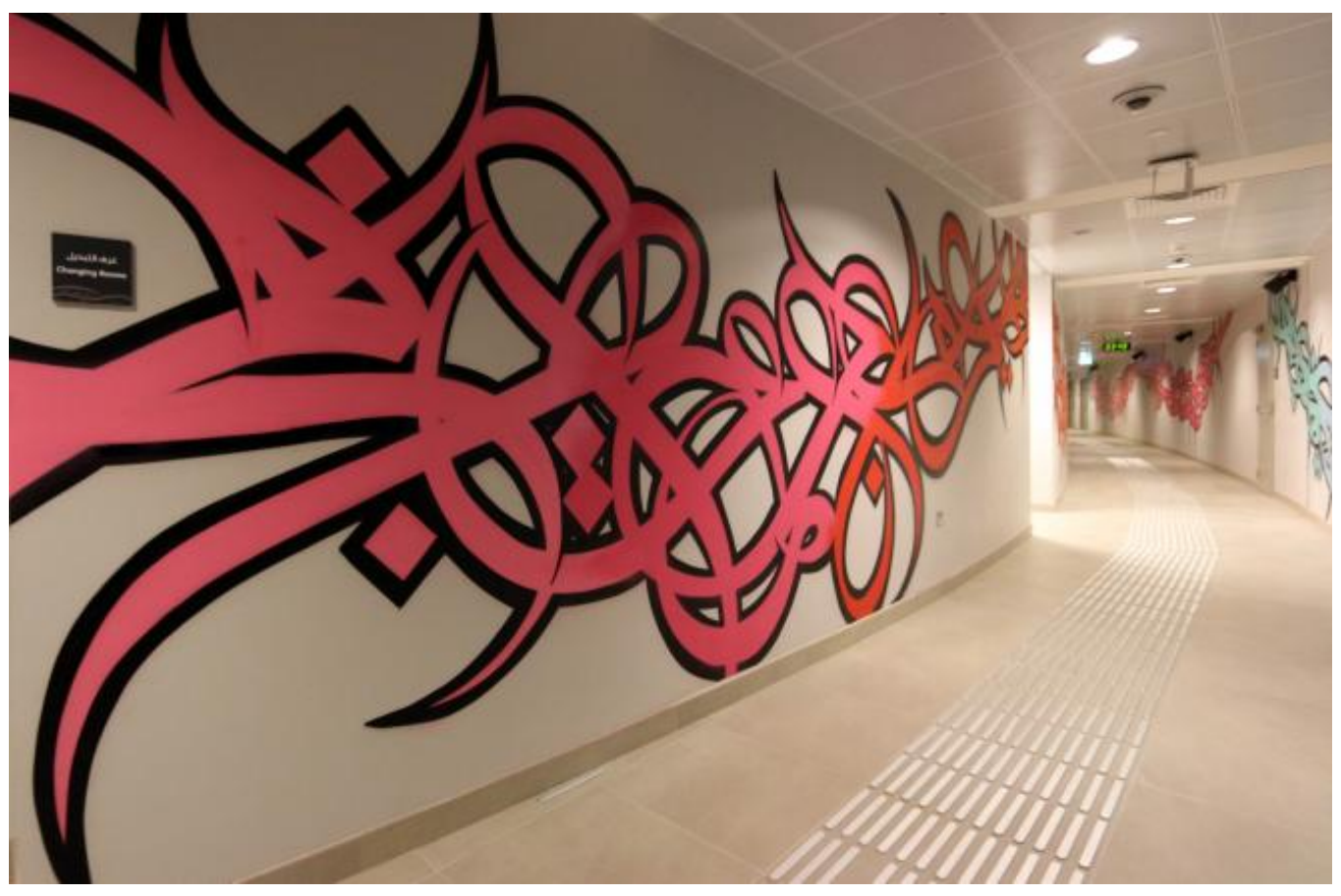
Calligraffiti, el Seed. Hallway murals.