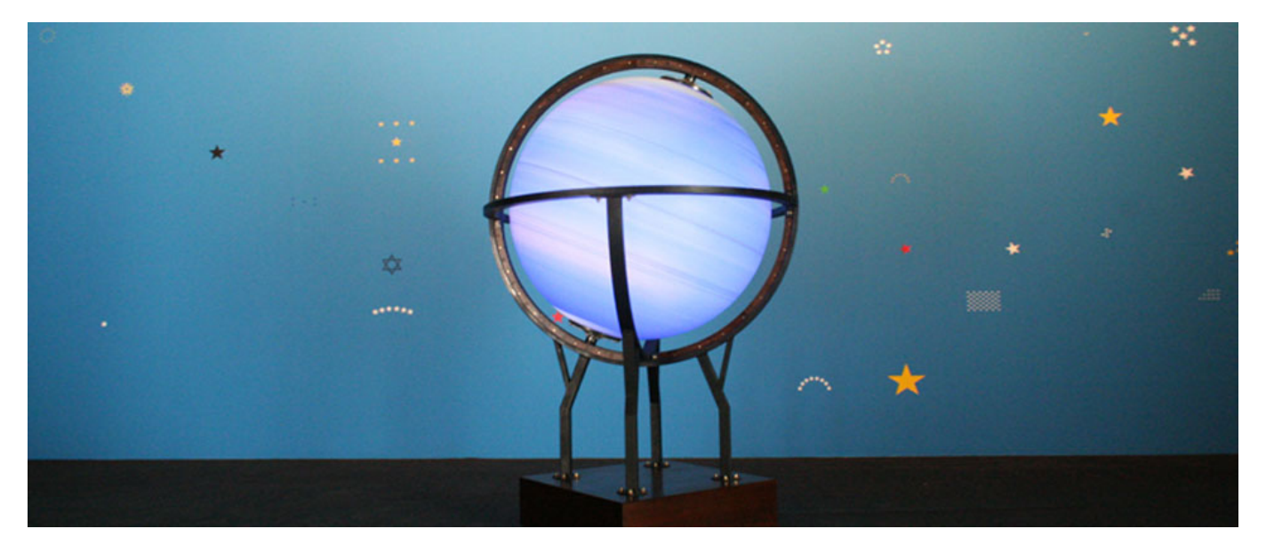
Faiçal Bagriche, "Souvenir", 2009