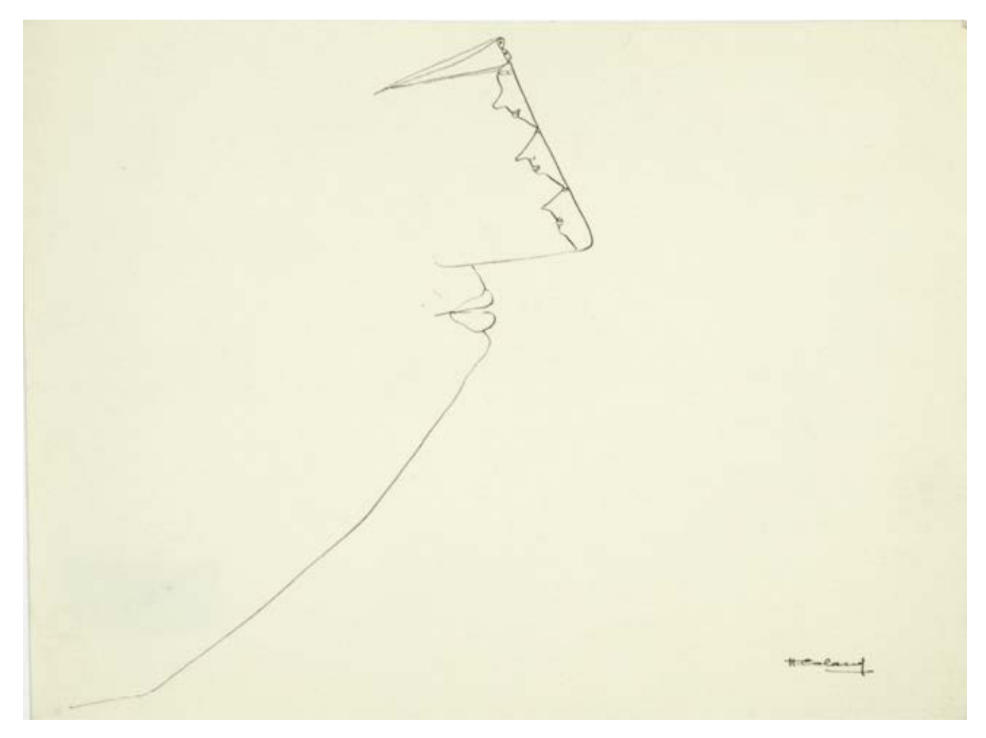
Huguette Caland, Untitled , 1972. Ink on paper, 7.5 × 9.5 inches.

Eux (c. 1975), a whipped mass of flesh-like pink ripples into surreal suggestions of mouths, eyes, and chins. Accompanying ink drawings from 1972 (all untitled) share that same lithe, economical, sometimes trembling line, which either wavers all the way across the page or wanders around in a single corner to create strange, whimsical visages.