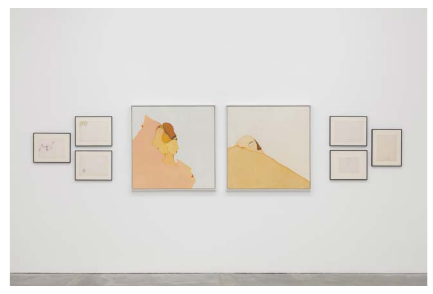
Exhibition 2: Huguette Caland, installation view.

kaftan, IAIA took the risk of eschewing that titillation, focusing instead on Caland's more formal preoccupations: specifically, her career-long obsession with line. While some US observers might skeptically wonder if the move to elide the sexier content is informed by IAIA's own cultural identity, I would emphatically disagree. In fact, it's a relief that the institution is allowing the art to make its mark free from the burden of the overdetermined framework of the "taboo-breaking" lady artist.