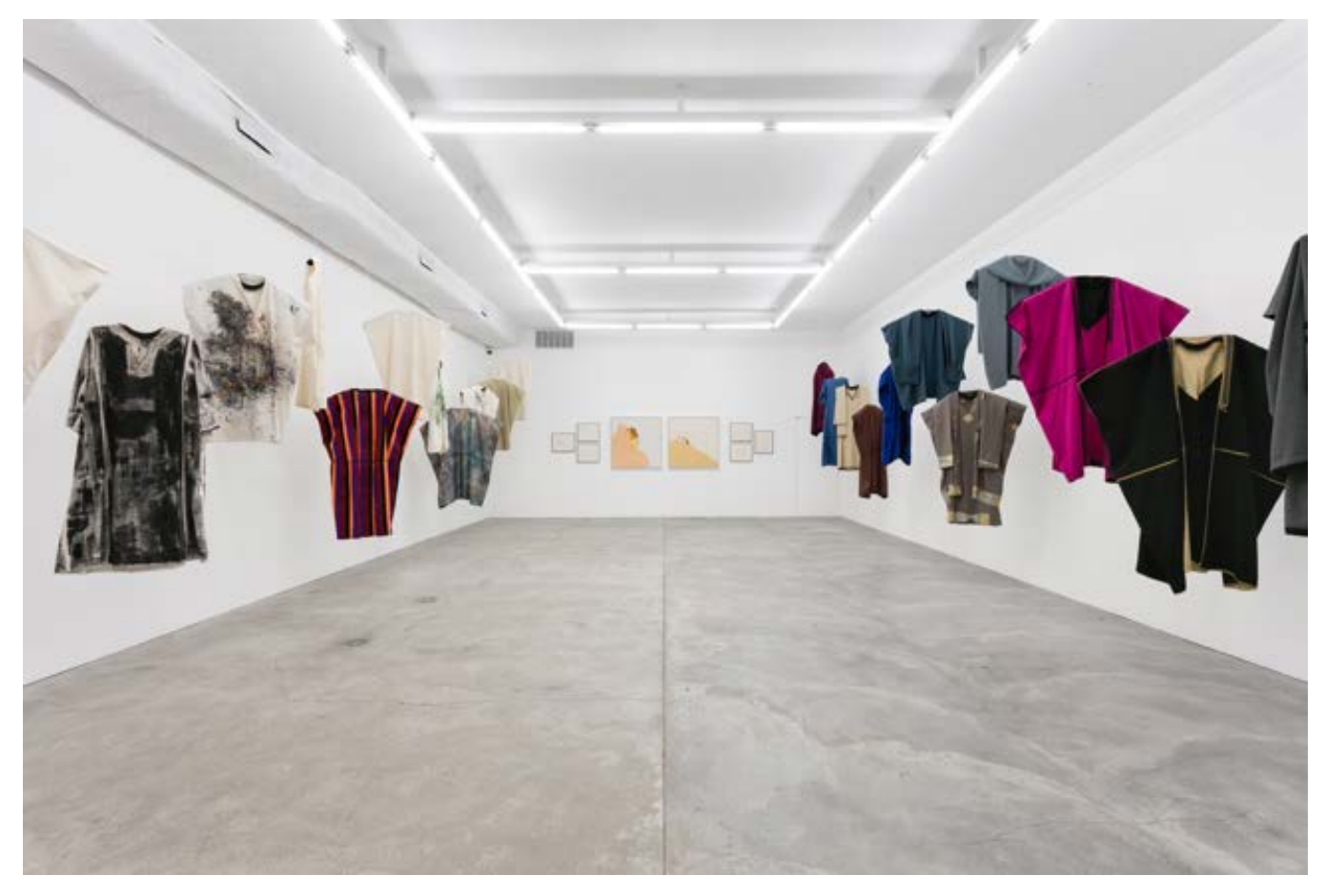
Exhibition 2: Huguette Caland, installation view.

Formal beauty trumps sexist stereotypes and salacious biography in the Lebanese artist's latest show.