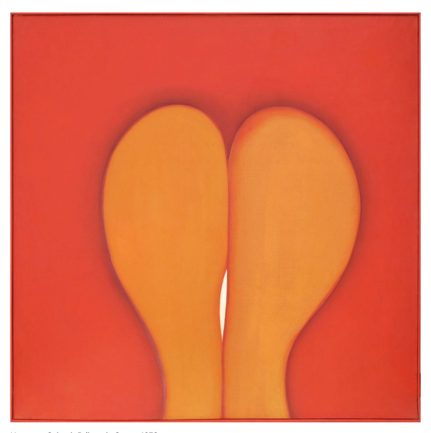
Huguette Caland, Bribes de Corps, 1973.