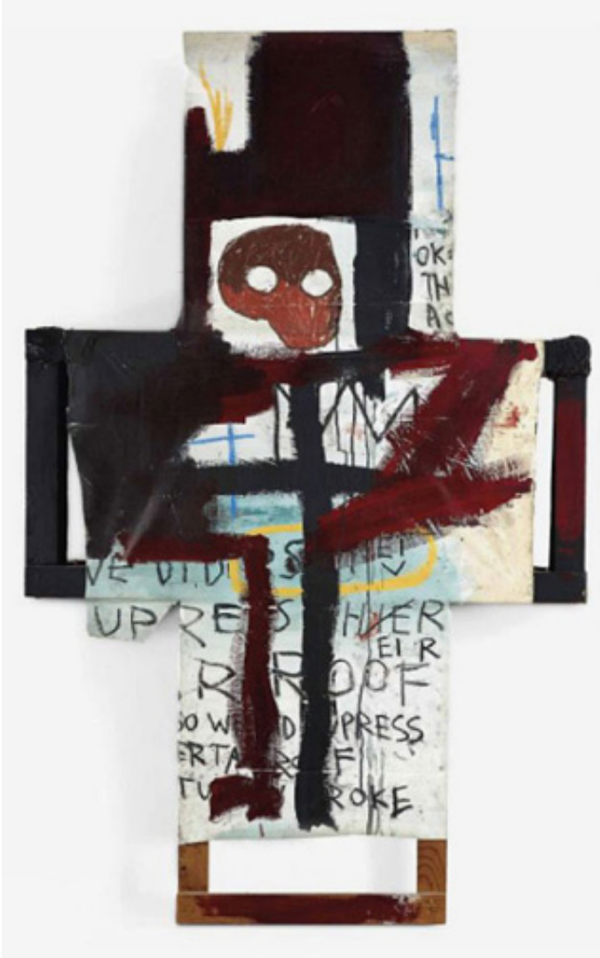
Jean-Michel Basquiat, "Crisis X" (1982)

Nine of the artists live and work in New Orleans; about twice as many come from post-colonial nations. Only one ( Liu Ding ) is from China. And one will be the subject of a special "show within a show" at the Ogden Museum of Art in New Orleans within the context of the greater biennial as a whole: Jean-Michel Basquiat, whose definitive 2005 retrospective was not-so-coincidentally co-curated by Sirmans as well.