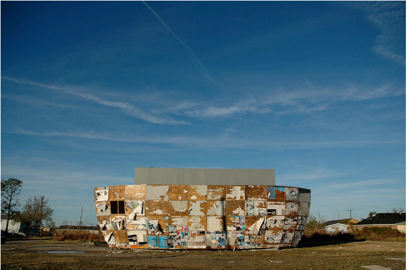
Mark Bradford's "Mithra" (2008) was one of the most talked about works during Prospect.1

by 66% less art and an artistic director who announced his resignation on its opening day (not to mention a largely forgettable stopgap exhibition in between), the Prospect New Orleans biennial has in many ways been an object lesson of what happens in the art world when the best of intentions collide with the hard facts of financial and administrative realities.