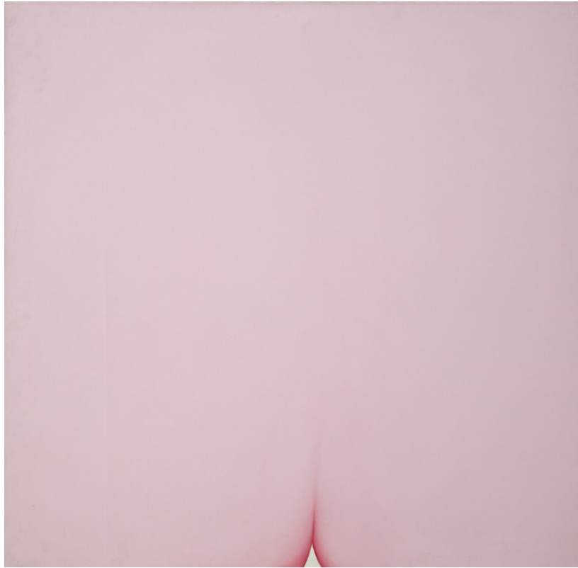
47" x 47" oil on linen 1973