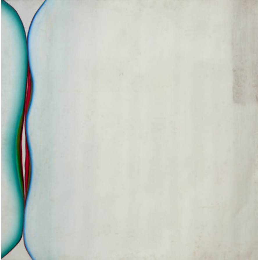
58.75" x 58.75" oil on linen 1974