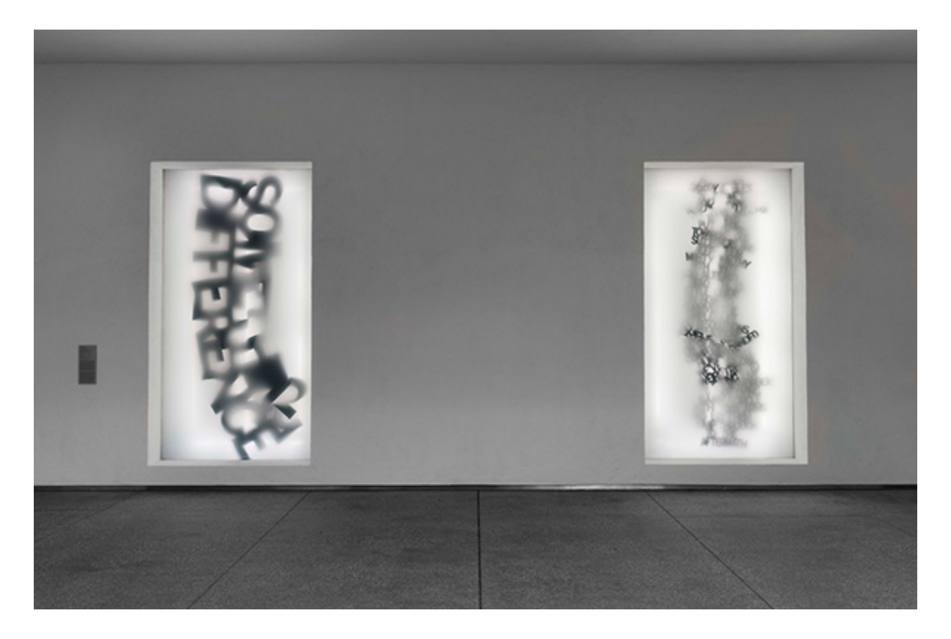
Dena Yago, installation view