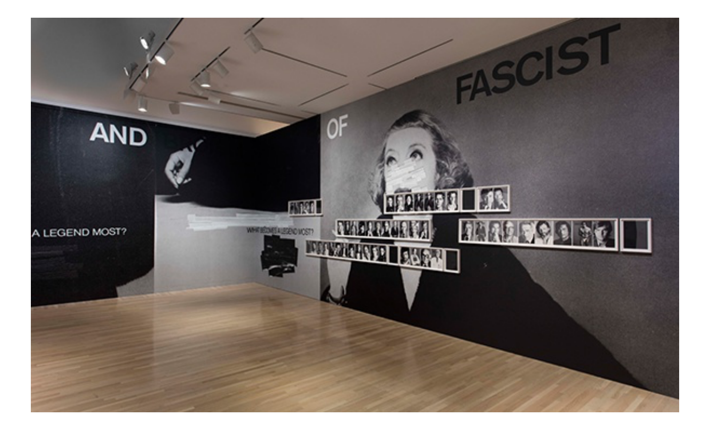
Mark Verabioff, installation view