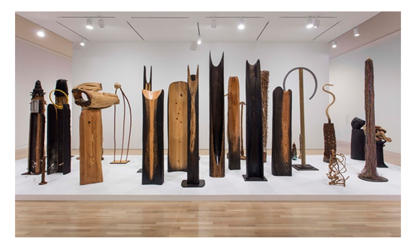
Kenzi Shiokava, installation view