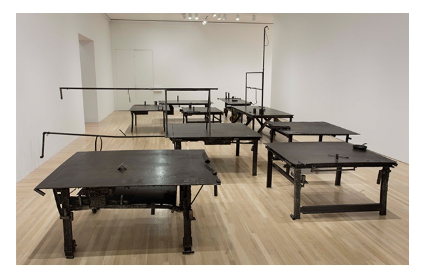
Sterling Ruby, installation view