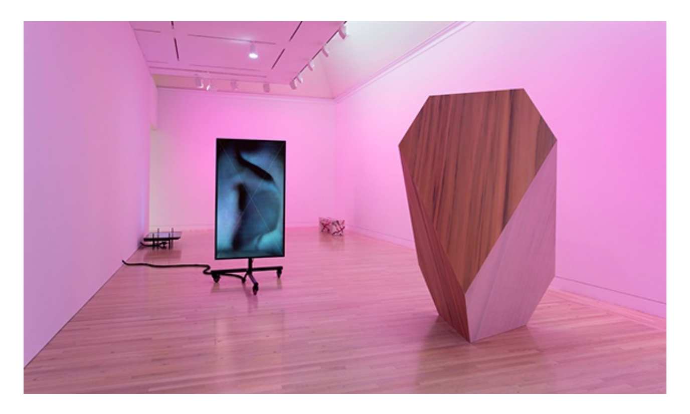
Shahryar Nashat, installation view