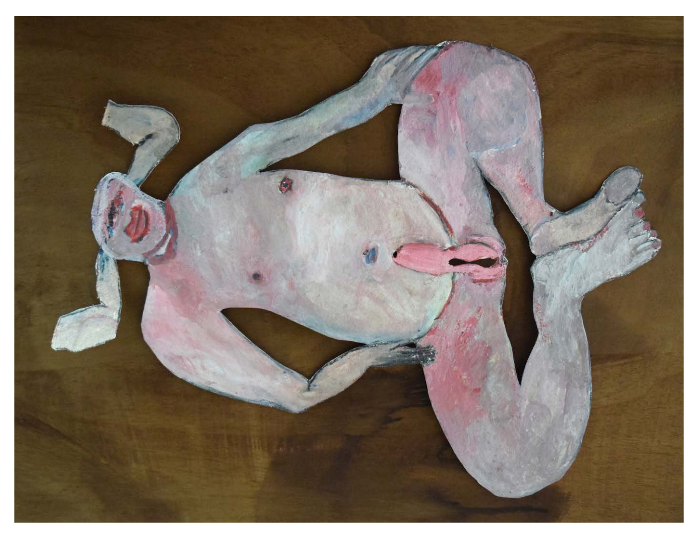
Anna Boghiguian, "The Garden of the Unconscious" (2016, detail)