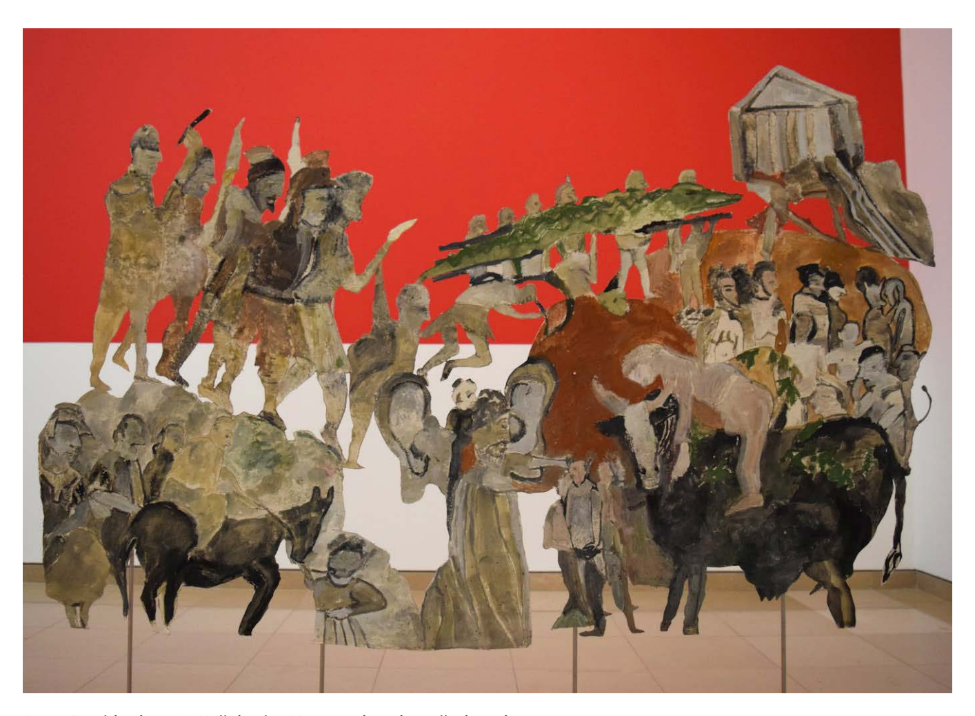
Anna Boghiguian, A Walk in the Unconscious installation view