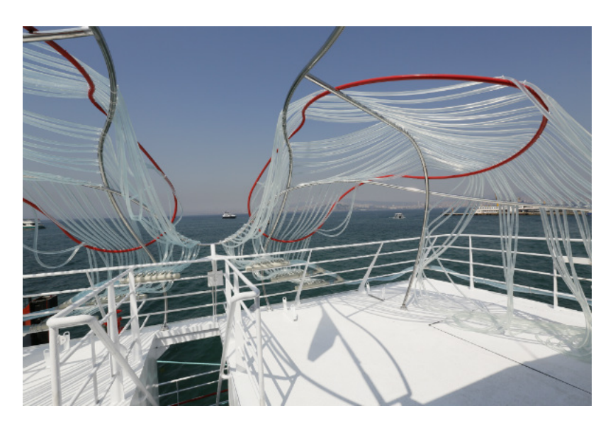
Saltwater Heart (2015) Pinar Yoldas

This work explores the nature, history, and science of salt, from the scientific formulas and maps of the world that decorate the draped sails to the piles of salt from Ethiopia, Pakistan, and Turkey.