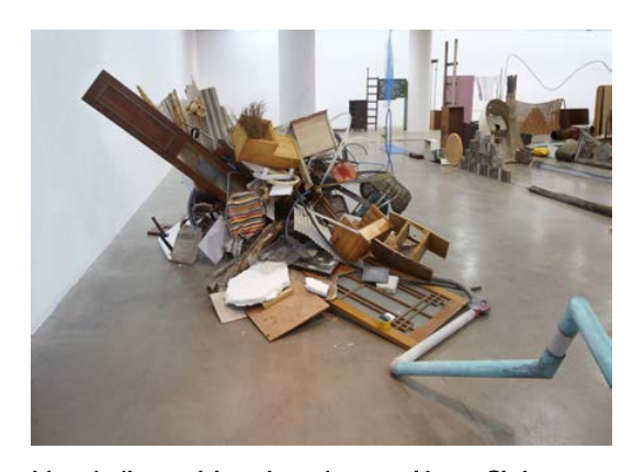
Vue de l'exposition Autodestrucción 8: Sinbyeong , Artsonje Center, Séoul, Corée du Sud, 2015