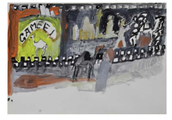
Cotton-Suez Canal, Camel, 2011