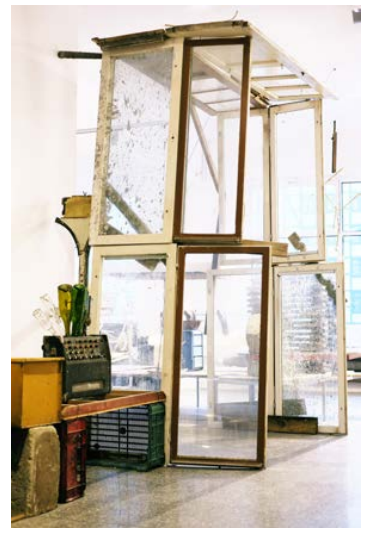
Vue de l'exposition Autodestruccion 6, Gdanska City Gallery 2, Gdansk, 2015