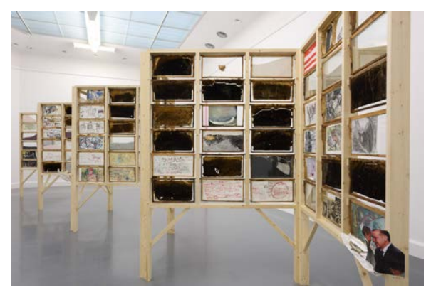
The Salt Traders, 2015