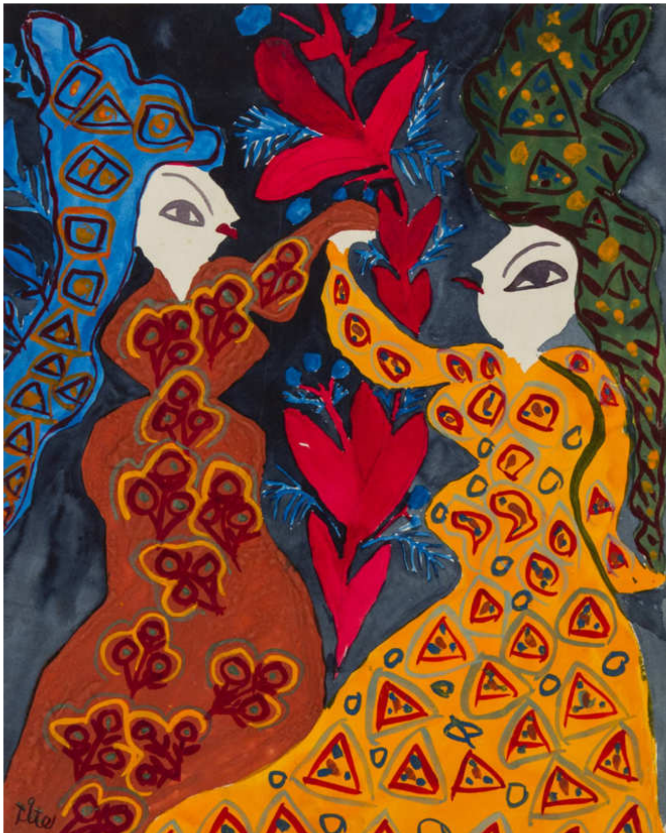
Baya, Deux femmes , (Two women), 1947; Gouache on board, 24 3/4 x 18 7/8 in. (62.9 x 47.9 cm); Collection of Adrien Maeght, Saint-Paul-de-Vence, France