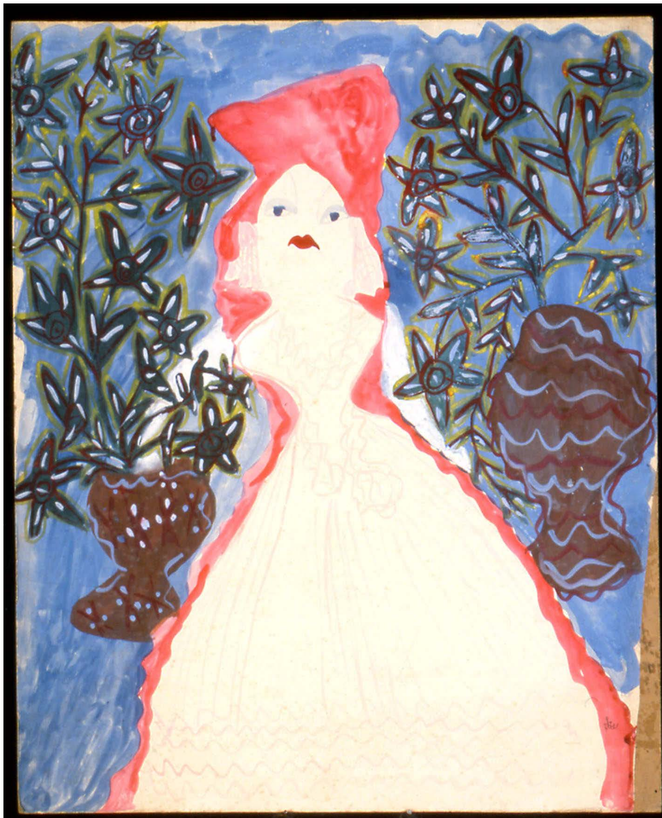
Baya, Femme au deux pots de fleurs , (Woman with two flower pots), 1947; Gouache on board 36 3/16 x 28 11/16 in. (91.9 x 72.9 cm); Collection of Adrien Maeght, Saint-Paul-de-Vence, France

"Baya: Woman of Algiers" is on view at NYU'S Grey Art Gallery through