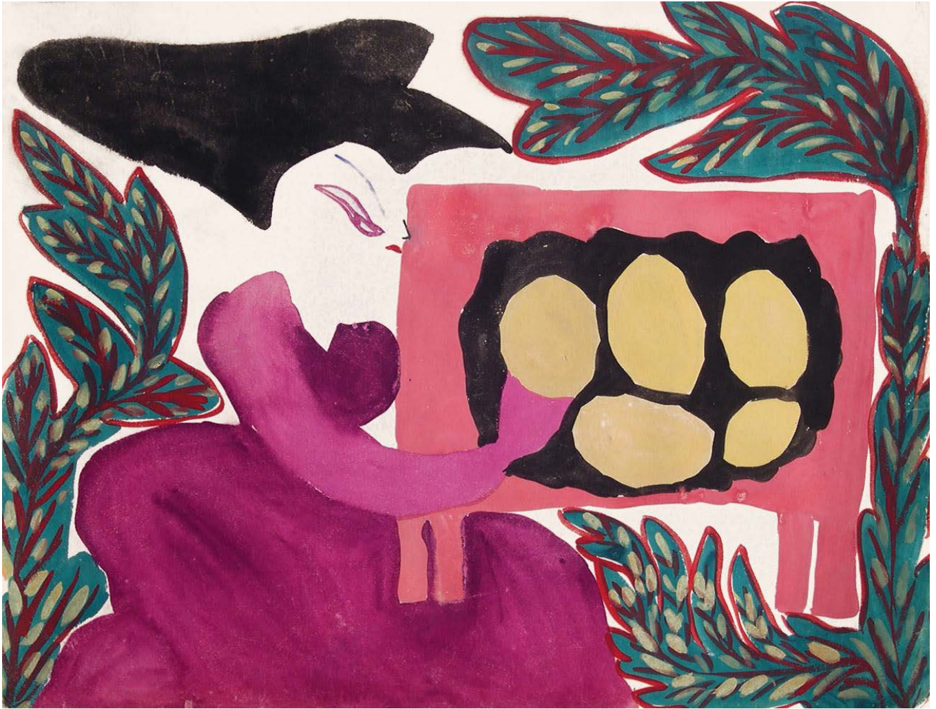
Baya, Femme aux oeufs , (Woman with eggs), 1947; Gouache on board 18 11/16 x 24 3/4 in. (47.5 x 62.9 cm); Collection of Isabelle Maeght, Paris