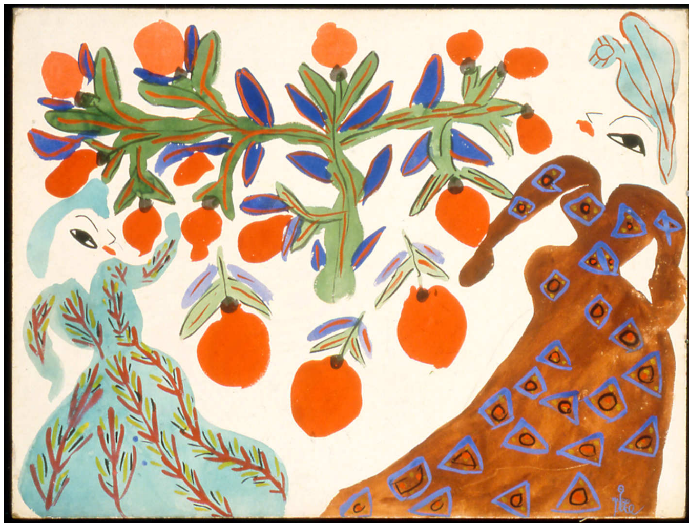
Baya, Femmes et oranges fond blanc , (Women and orange trees on a white background), 1947; Gouache on board 18 7/8 x 24 3/4 in. (47.9 x 62.9 cm); Collection of Isabelle Maeght, Paris

In the 1940s, a 16-year-old girl captured the minds of the art world's elite. The self-taught Algerian artist, Baya Mahieddine (1931-1988) — known as Baya — is finally being celebrated in the first North American exhibition of her work, at NYU's Grey Art Gallery, through March 31. Baya used gouache as her primary medium, depicting a world without men but full of bright images of women, nature, and animals. The bold patterns in her work are attention-grabbing, but her life story is even more so.