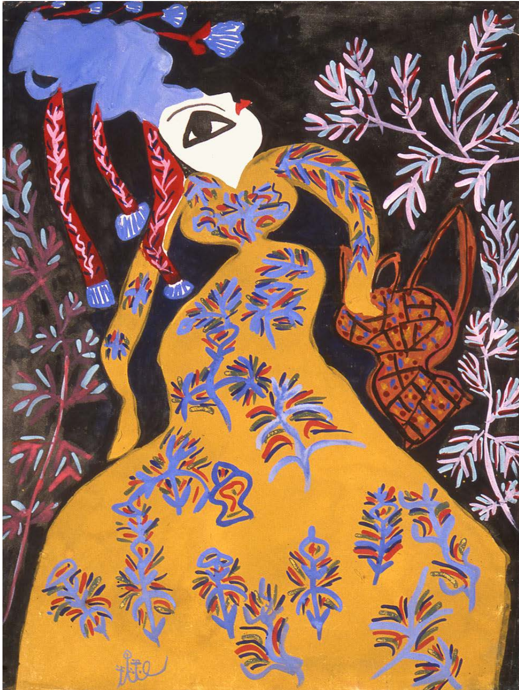
Baya, Femme robe jaune et panier , (Woman in yellow dress with a basket), 1947; Gouache on board 25 7/16 x 19 1/2 in. (64.6 x 49.5 cm); Collection of Isabelle Maeght, Paris