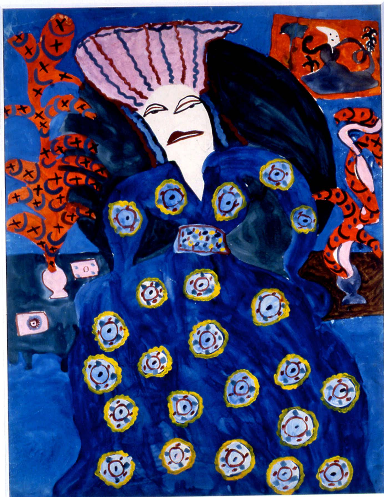
Baya, Femme robe à fleurs blanches , (Woman in a white-flowered dress), 1947; Gouache on board 39 x 30 in. (99.1 x 76.2 cm); Collection of Adrien Maeght, Saint-Paul-de-Vence, France