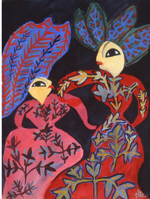
Baya, Deux femmes fond bleu foncé , (Two women on a dark blue background), 1947; Gouache on board 25 7/16 x 19 1/2 in. (64.6 x 49.5 cm); Collection of Adrien Maeght, Saint-Paul-de-Vence, France