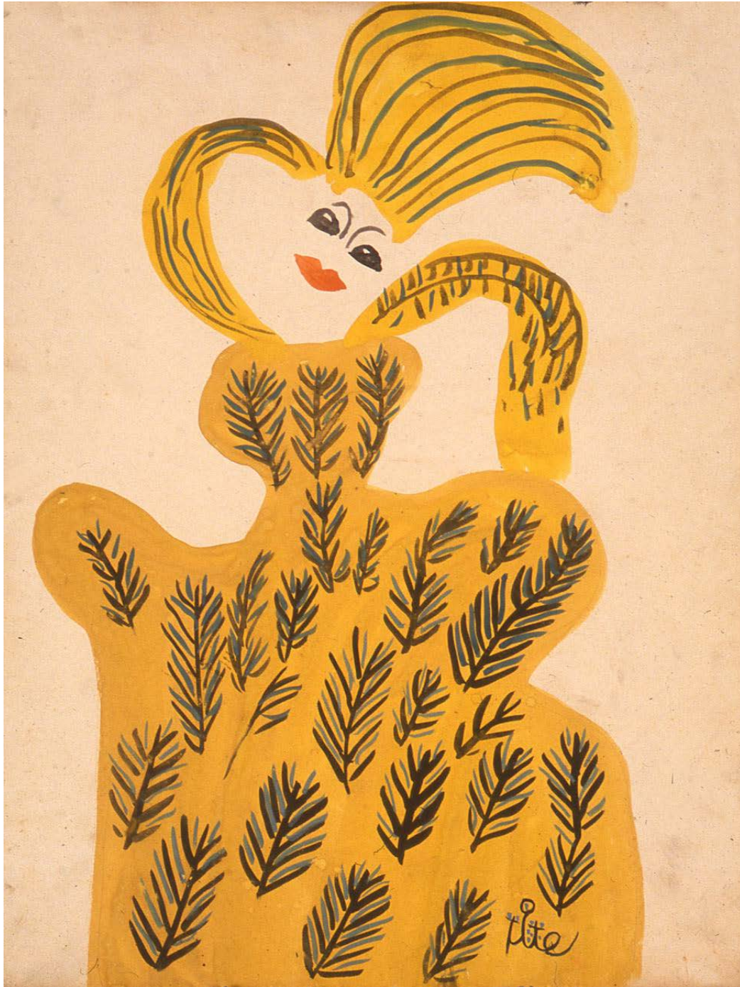
Baya, Femme robe jaune fond blanc , (Woman in yellow dress on a white background), 1947; Gouache on board 18 1/8 x 14 7/6 in. (46 x 36.7 cm); Collection of Adrien Maeght, Saint-Paul-de-Vence, France