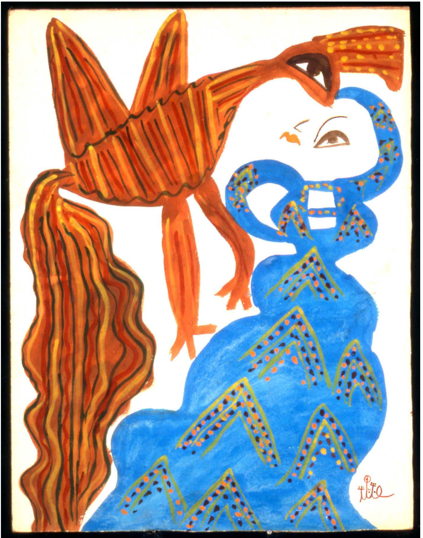
Baya, Femme robe à chevrons , (Woman in chevron-patterned dress), 1947; Gouache on board 25 7/16 x 19 1/2 in. (64.6 x 49.5 cm); Collection of Adrien Maeght, Saint-Paul-de-Vence, France