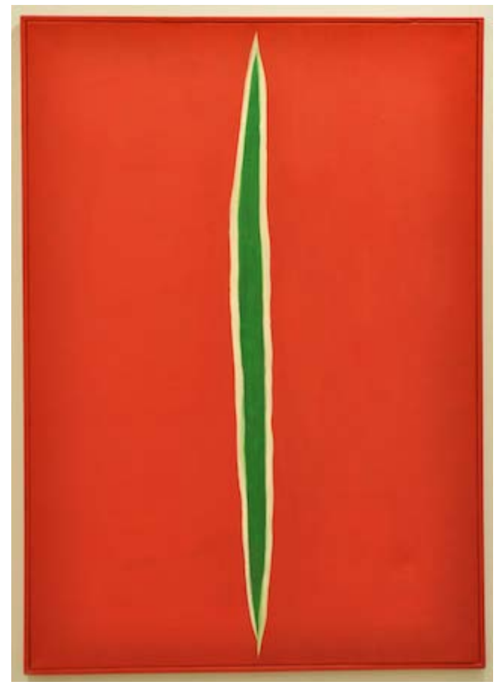
Huguette Caland, "Untitled" (1968), oil on canvas, 100 x 70cm, Galier Janine Rubeiz

Even today, the history of modern art may be a little more inclusive, with additions from Latin America and East Asia, but massive gaps remain. Modern art of the Arab and Islamic worlds is still largely absent from art history, except for the occasional sojourns by already enshrined Modernists, like Matisse in Algeria or Le Corbusier in Iraq. And while the history of modern art may have started later in Cairo or Beirut than Paris or New York, it is wrong to assume that it didn't — or doesn't — exist.