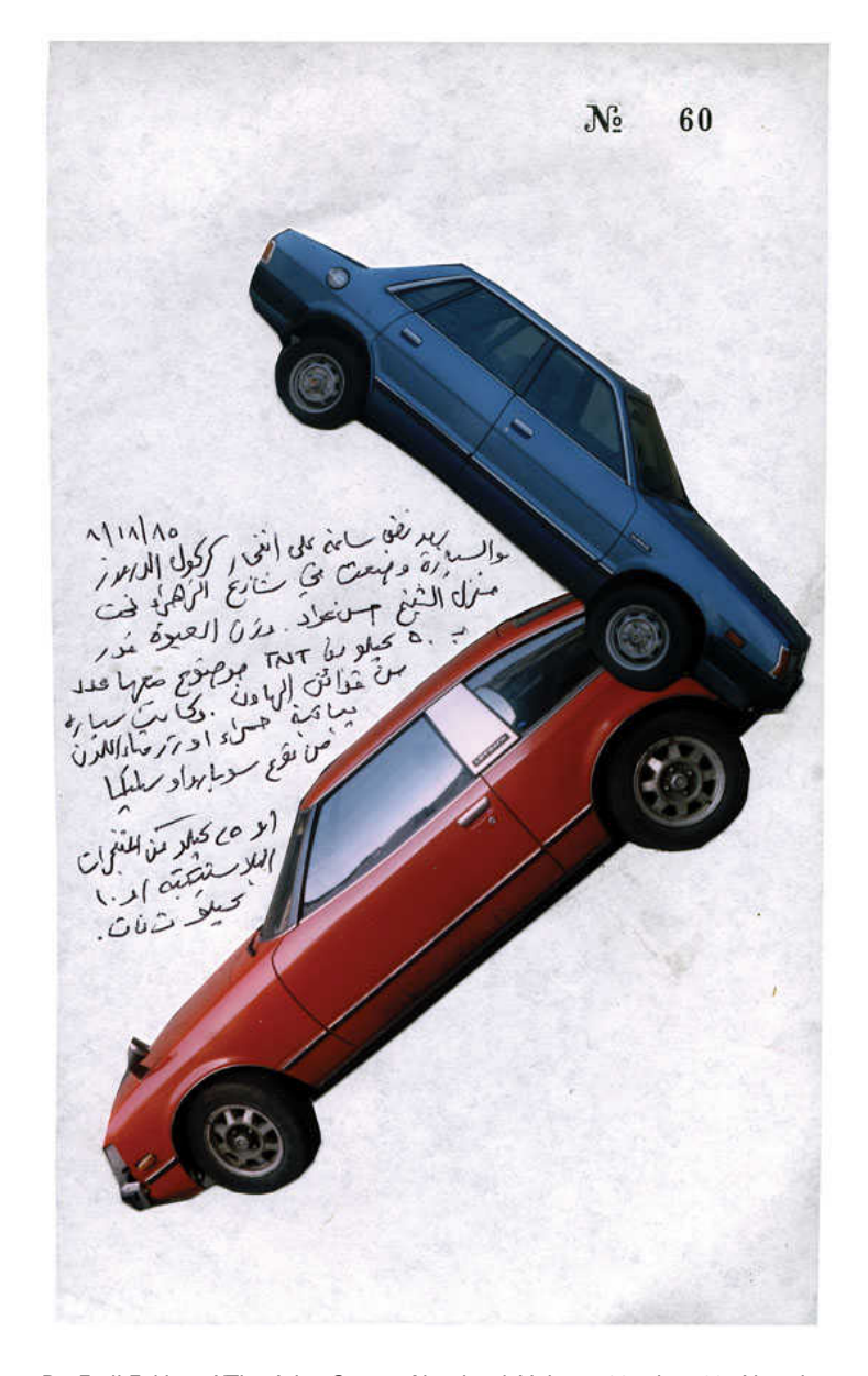
Dr. Fadl Fakhouri/The Atlas Group, Notebook Volume 38, plate 60, Already Been in a Lake of Fire, 1975–2002.

Even though—or perhaps because—it's such a small country, Lebanon has been swept up in a number of major geopolitical encounters over the past 200 years. From its seeds in the Ottoman Empire, its brief tenure under a French mandate and, more recently, 15 years of civil war among various Lebanese political parties and their militias (Lebanese Forces, Mourabitoun, Amal, Hezbollah, Communist Party, and Progressive Socialist Party, among others), armies (Lebanese, American, French and Israeli, among others) and additional Arab militias, armies and parties (Palestinian, Syrian, Iranian, Libyan, Iraqi, and Saudi, among others), Lebanon has witnessed sophisticated cosmopolitanism and horrific carnage, and now tenuous rebuilding.