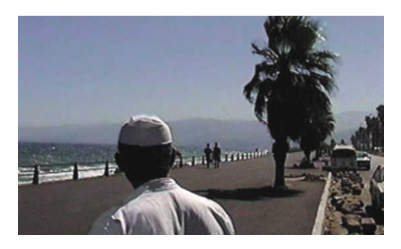
Walid Ra'ad, The Dead Weight of Quarrel Hangs, 1998, single-channel video, 18 minutes.

Of course, this is somewhat of a caricature, one that I am certain some will recognize. But this is the caricature that partly informed the "performance" dimension of the Atlas Group's lecture/presentation titled The Loudest Muttering Is Over: Documents from The Atlas Group Archive . This ongoing, always-in-progress 70-minute lecture/presentation looks and sounds like a college lecture, an academic conference presentation, or an artist talk. I sit behind a rectangular table facing the audience. I show slides and videotapes on a screen to my left. I speak into a microphone. There are a glass of water, a notebook, a pen, and a lamp on the table. I wear a light shirt and dark dress pants. I encounter technical difficulties. I am interrupted by people I have planted in the audience, who also ask questions during the question and answer period. I also answer nonscripted questions.