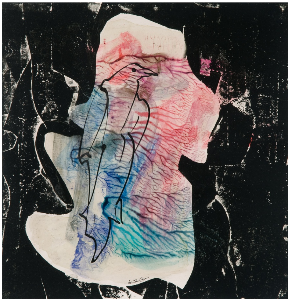
Abdallah Benanteur, Portrait de l'Oiseau-Qui-N'Existe-Pas , 2004. Mixed media on cardboard, 30 x 28 cm. Copyright Abdallah Benanteur. Courtesy Galerie Claude Lemand, Paris.