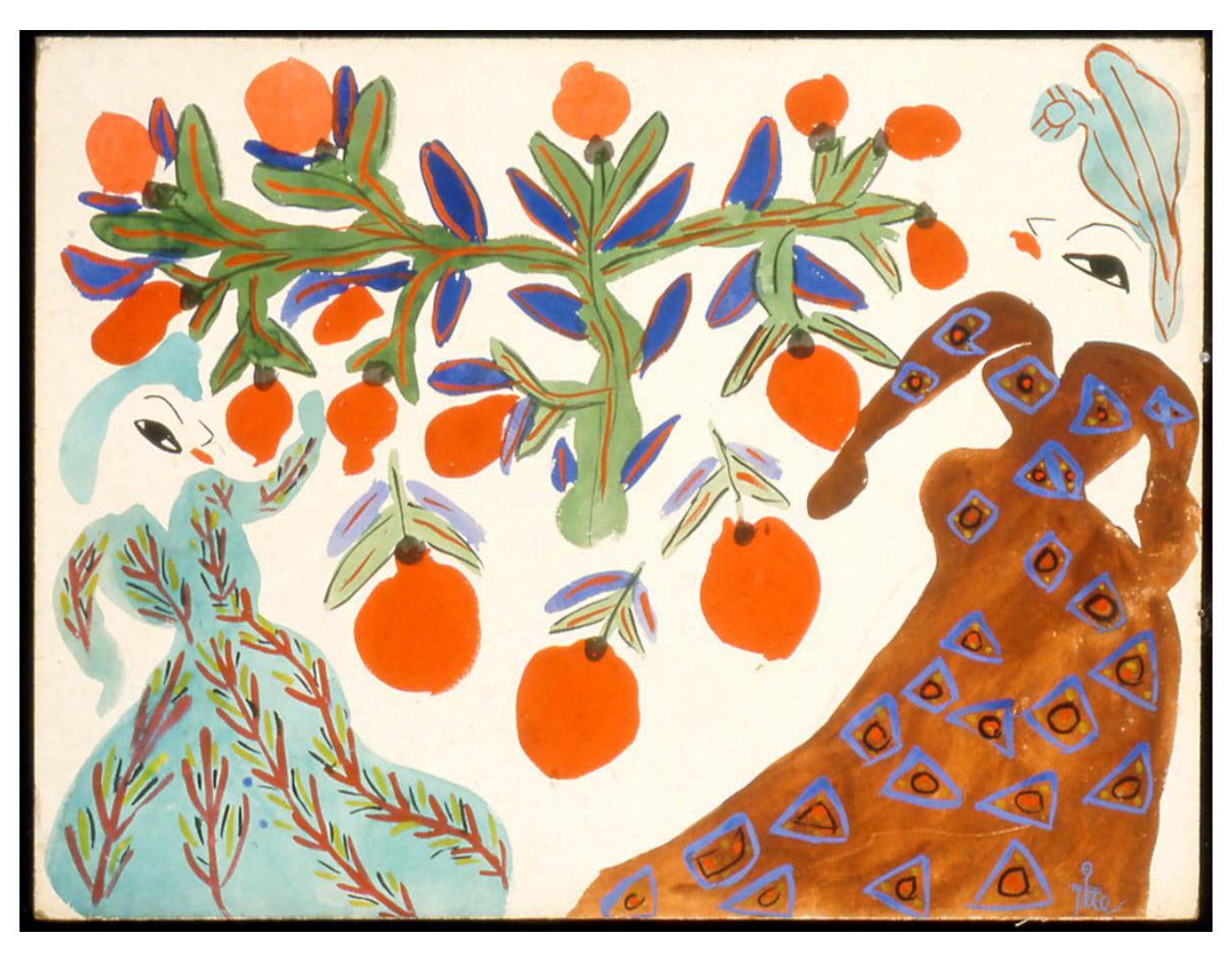
"Femmes et orangers fond blanc (Women and orange trees on a white background)" (1947)

But is such loose juxtaposition the best means of capturing Baya? Movies have the so-called <u>"Bechdel Test"</u> to affirm whether a filmmaker has met minimum feminist criteria. While there are many Bechdel variants one might propose for curating an art exhibition, leaving "Baya: Woman of Algiers," I wished particularly for one with a Modernist spin. Call it the "Baya Test": Can an exhibition on twentieth-century art reference at least one female artist, and can it elevate her work without showing how it "inspired" that of a male Modernist? "Baya: Woman of Algiers" passes the first part with flying colors — literally, if one considers Baya's spectacular patterns and palettes. But in featuring Picasso so prominently it falters in the second. All the more so given how assiduously Baya seems to have avoided any hint or trace of men in her artwork: With the exception of one landscape, all the paintings in the exhibition are of female subjects, alone