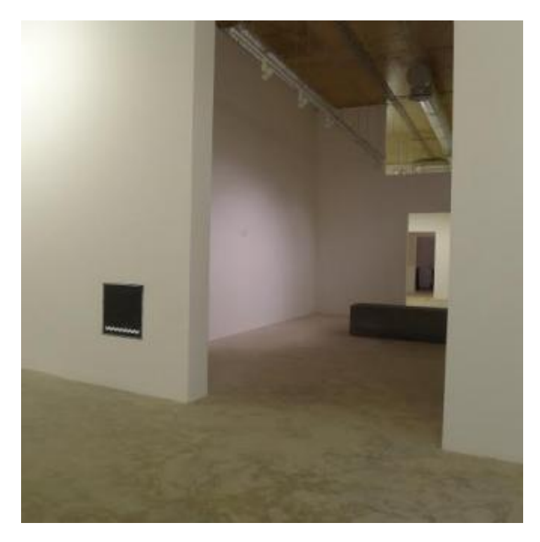
Walid Sadek, On the labour of missing, 2012, Installation (Wall drawing – Plexiglass – Concrete bench), Variable dimensions, Galerie Tanit – Beyrouth, 2012

Avakian's work can be found at: <u>Kalfayan Galleries, 11 Haritos Str, 106 75</u> <u>Kolonaki, Athens, Greece</u>, +30 210 7217679