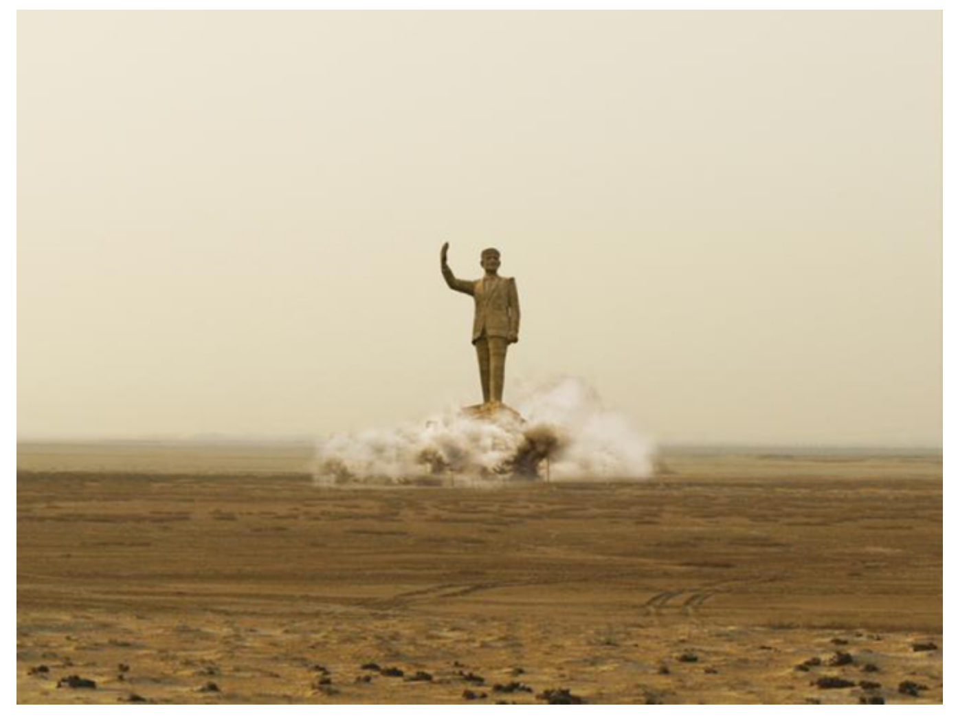
Ali Cherri, Pipe Dreams, 2011 – 2-channel video installation