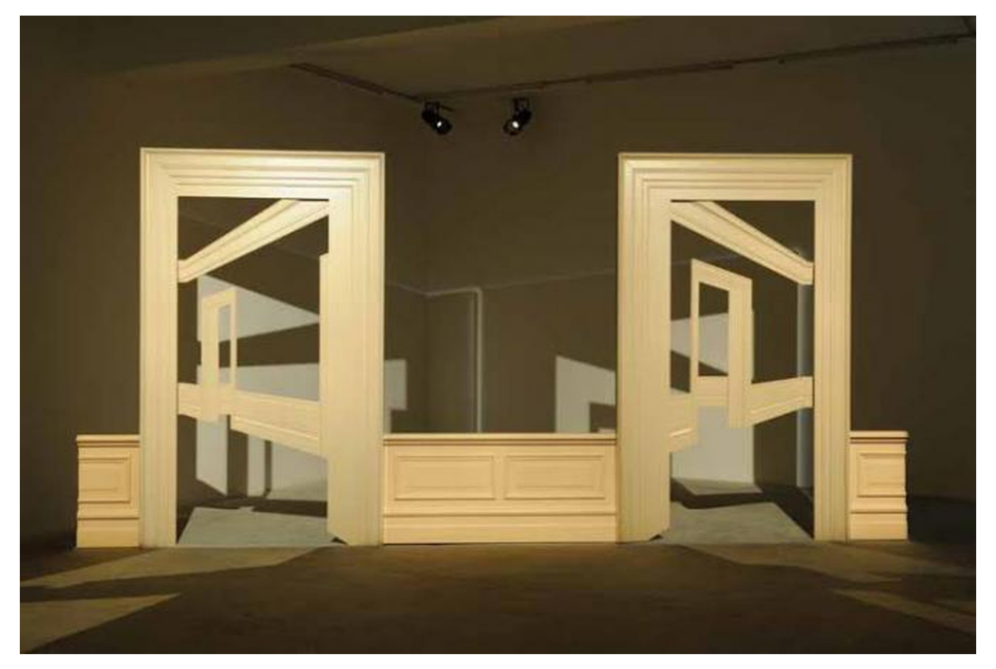
Walid Raad, Views from outer to inner compartments, Untitled II, 201, Wood, paint, 250 x 500 x 20 cm | Courtesy the artist & Sfeir-Semler Gallery Beirut/ Hamburg

Sadek's work can be found at: Galerie Tanit, East Village Building, Beirut, Lebanon, +961 76 557 662 (Beirut)