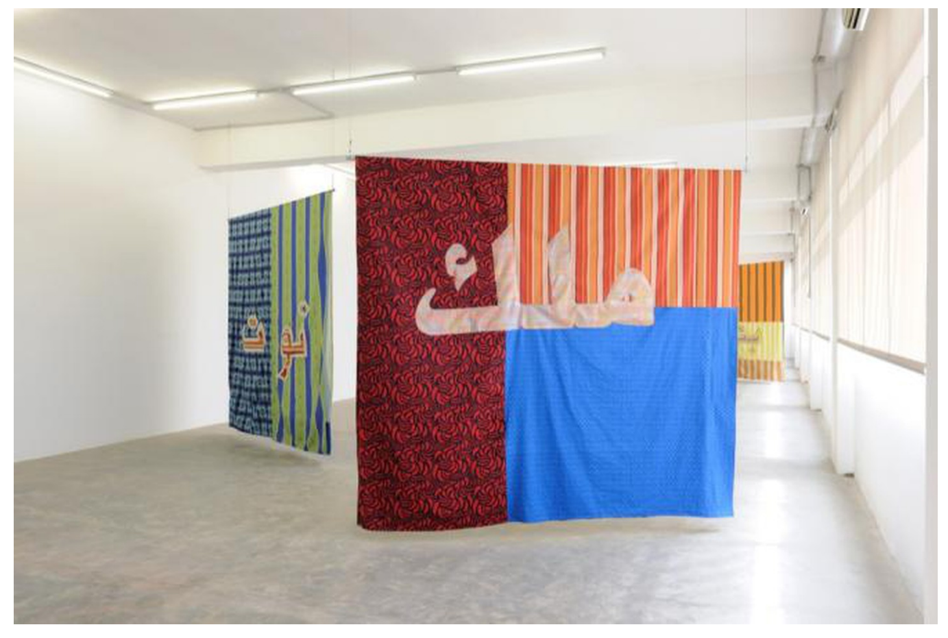
Mounira Al Solh Sama'/Ma'as, 2014 Double-sided patchwork textile curtain 275 x 286 cm, each Installation view Sfeir-Semler Gallery, Beirut

Joreige's work can be found at <u>Taymour Grahne Gallery, 157 Hudson</u> <u>Street, New York, NY USA</u>, +1 212 240 9442; Galerie Tanit, East Village Building, Beirut, Lebanon, +961 76 557 662; and <u>Tate Modern, Bankside,</u> <u>London SE1 9TG, UK</u>, +44 (0)20 7887 8888