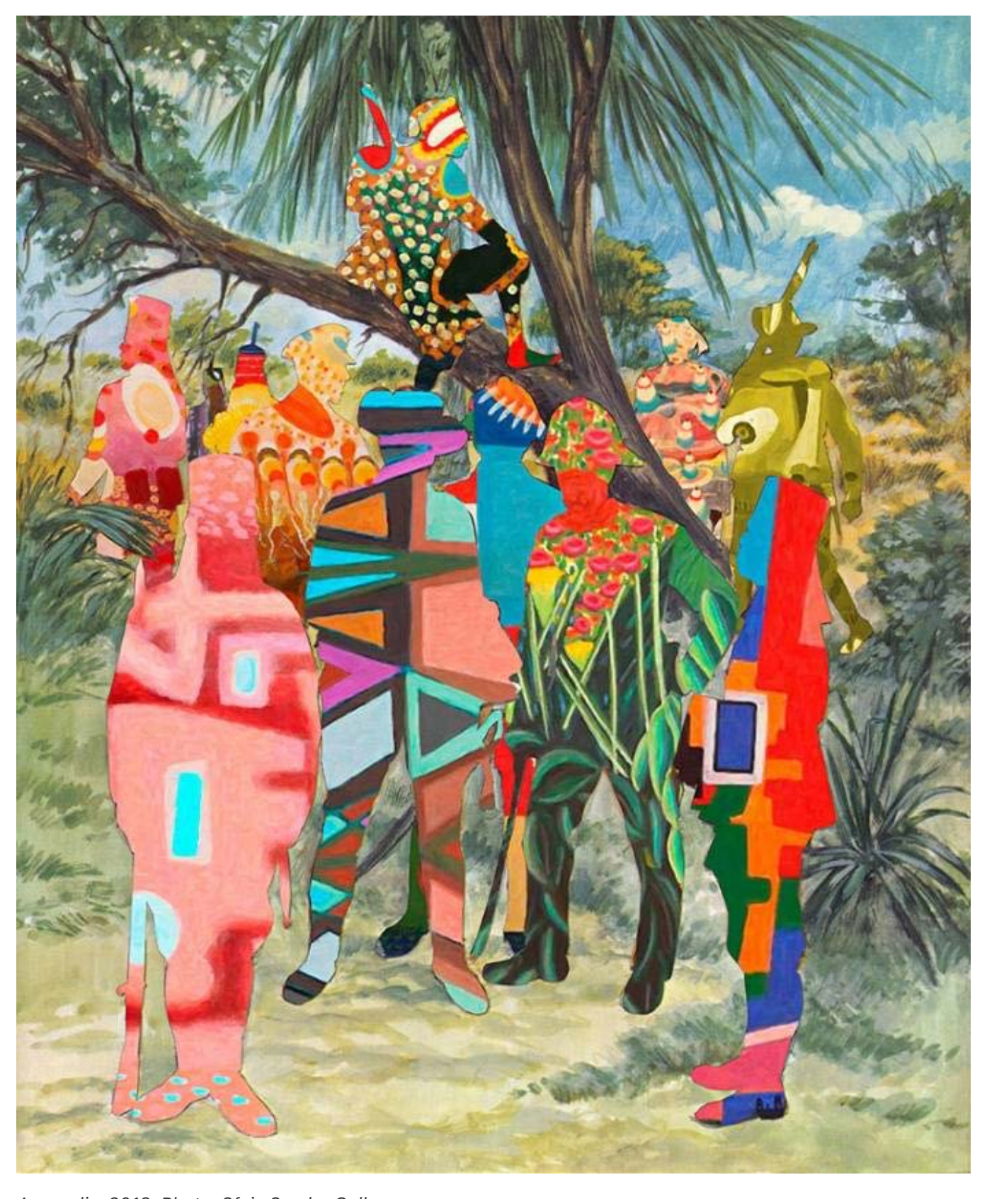
Appendix, 2018.

Within these exhibitions are the more mundane but relevant pieces of work, pots, architectural pieces and photos of everyday life, untouched and presented in a traditional way.