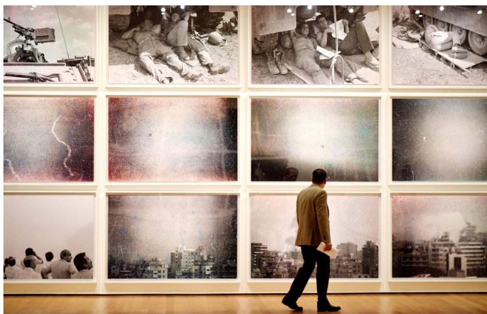
Walid Raad ( https://www.artnews.com/t/walid-raad/ )'s 2015 survey at the Museum of Modern Art in New York.