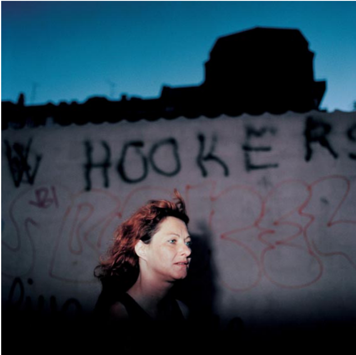
From the series/Ur serien Now That You Are Mine, 1997–2000