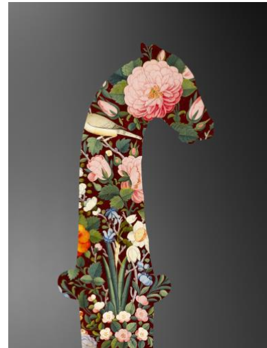
Fig. 3. Walid Raad, Préface à la troisième édition: Reliure , 2013, archival inkjet print, 28,1 x 50,8 cm. Courtesy of the artist and Sfeir-Semler Gallery Hamburg/Beirut.

Raad’s interest in the history of modern art in Lebanon is expressed most clearly in Index XXVI: Red (2010). The piece comprises a section of wall on which different cut-out elements, vinyl letters, and spray paint are combined. As such, the wall element appears to have been cut out of a gallery space and is now freestanding; it seems to be a displaced architectural element. Printed in white Arabic letters on white walls in a horizontal line, the names of one hundred and fifty Lebanese artists are, even to a viewer familiar with the Arabic script, hardly legible. It also features cut-out photographs, newspaper articles, diapositives, sales