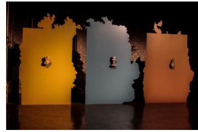
Fig. 4. Exhibition view of Kicking the Dead at steirischer herbst, Graz (Austria), September 22–October 15, 2017. Les Louvres: Preface to the third edition_Acknowledgements (2017), three painted wooden panels, 3D-printed objects, painted shadows and lighting.

Throughout the performance, characters appear to disappear and emerge again in a different context. Raad celebrates the return of singular authorship, which had formerly been obscured by The Atlas Group . On the other hand, this subject appears manic and subtly scrutinizes artistic subjectivities, deconstructing them with fissures that