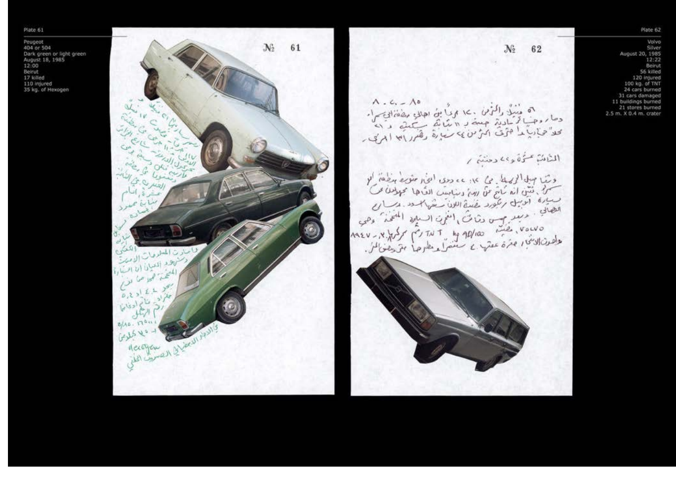
AG_AFF:ABLF/61-62, 2003. Color print. Courtesy of The Atlas Group/Walid Raad, 24 x 30 cm

An Atlas Group production typically involves the following: press photographs, news clippings, interview transcripts, video footage, graphics, images, and text along with elements of performance, collage, digital photography, and video art, all rolled into the physical framework of an artist's talk or academic lecture — a table, a microphone, a few lights, a stack of papers, a screen behind, an audience in front, a presenter in between. It is a rather sterile and austere environment, though packed to the gills with material. After all, the Atlas Group thrives on documents, filing them away into three distinct categories that comprise the organization's archives. But those documents — some found, others produced — function not as emblems of fact or scraps of evidence to support the assertions of history, but rather as traces, as symptoms, as strange structural links between history, memory, and fantasy, between what is known to be true and what is needed to be