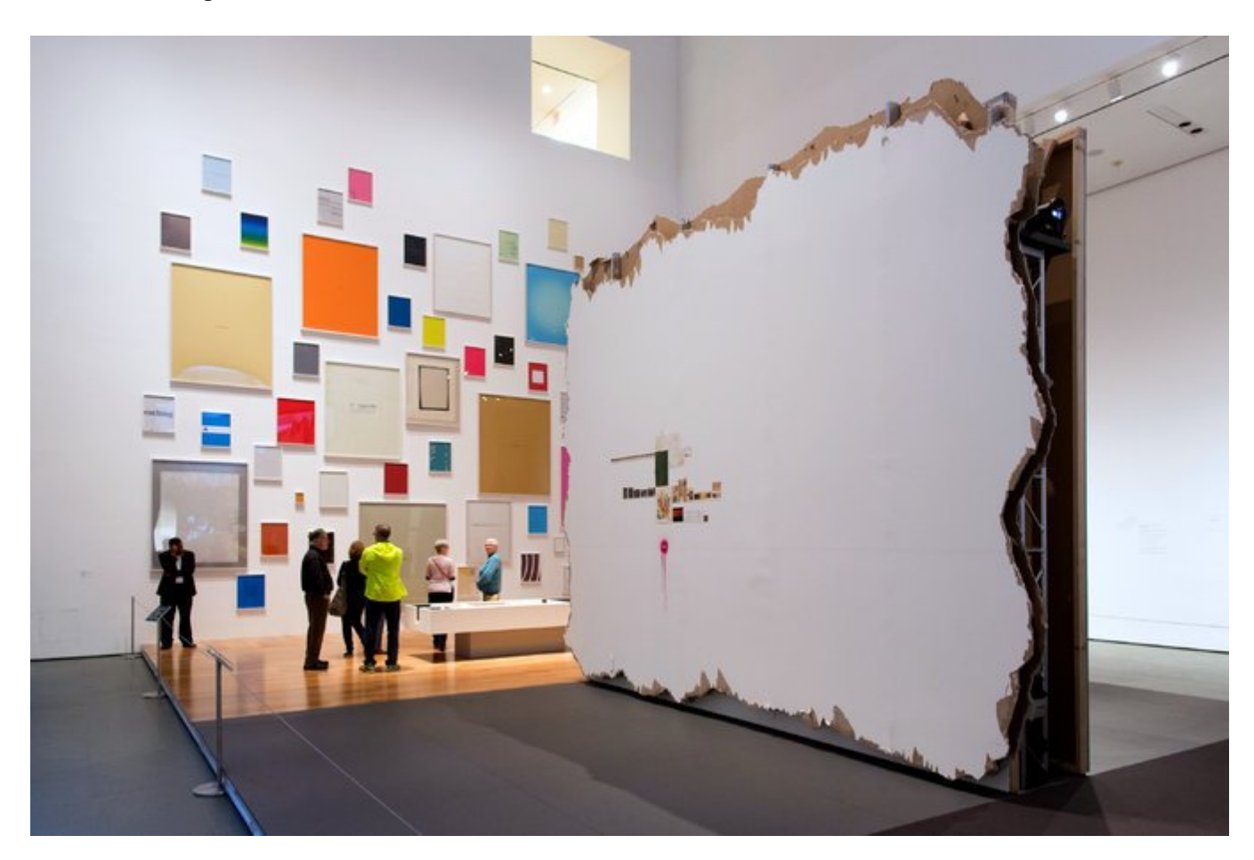
Rear, a wall of prints titled "Appendix XVIII"; in the foreground, the installation "Index XXVI Red."