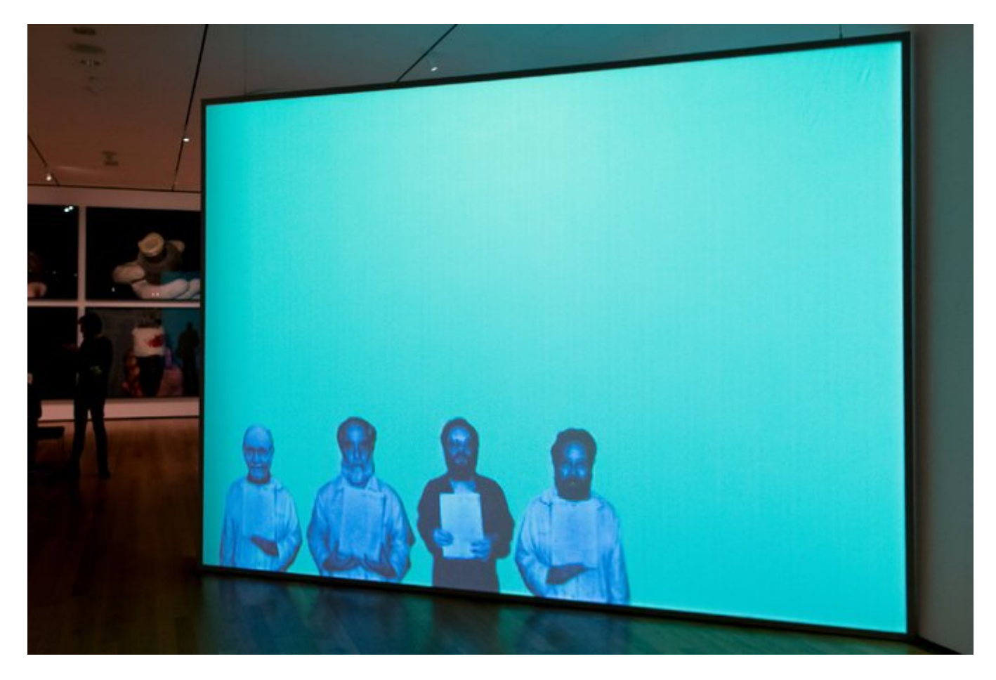
A 2001 video, "Hostage: The Bachar Tapes (English Version)," combines real news images of American captives in Lebanon with those of a fictional character named Souheil Bachar, played by an actor, who claims to have shared a cell with the Americans.

The group itself was responsible for several absurdly labor-intensive documentation projects. One project involved clipping and collaging images of cars from magazine advertisements, each car corresponding in make and model to one of the many thousands of vehicles destroyed in car bombings. Handwritten annotations in Arabic ("BMW, White, April 8, 1986, 11 killed") give a veneer of forensic authenticity, but the collages themselves, with their bright colors and angled automotive forms, suggest that archival labor is not without aesthetic considerations.