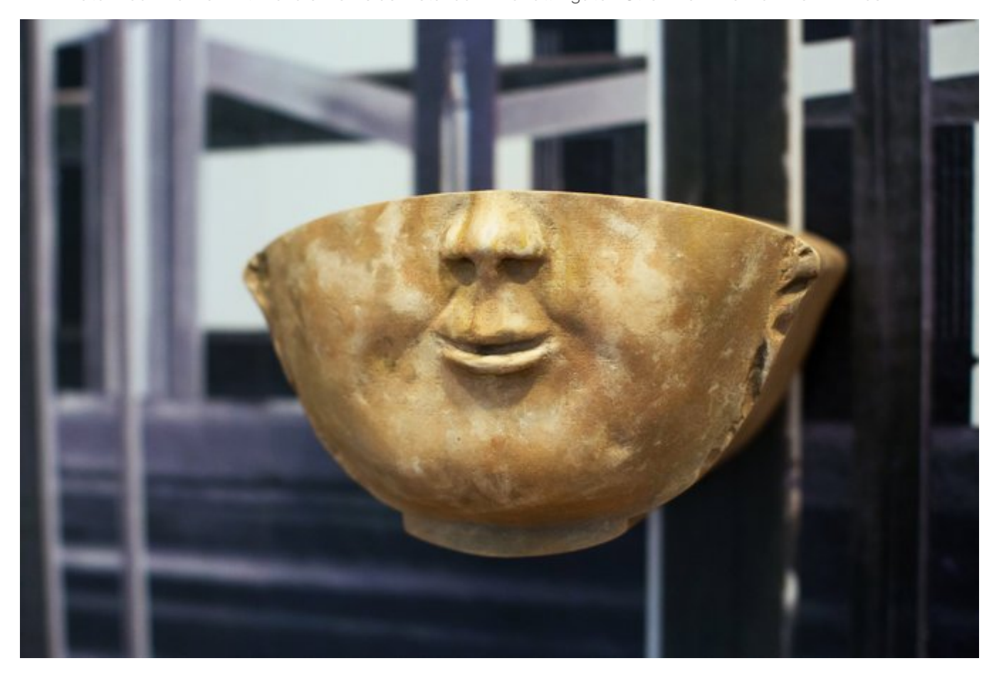
A sculpture titled "Preface to the third edition_Acknowledgements, Coupe II."