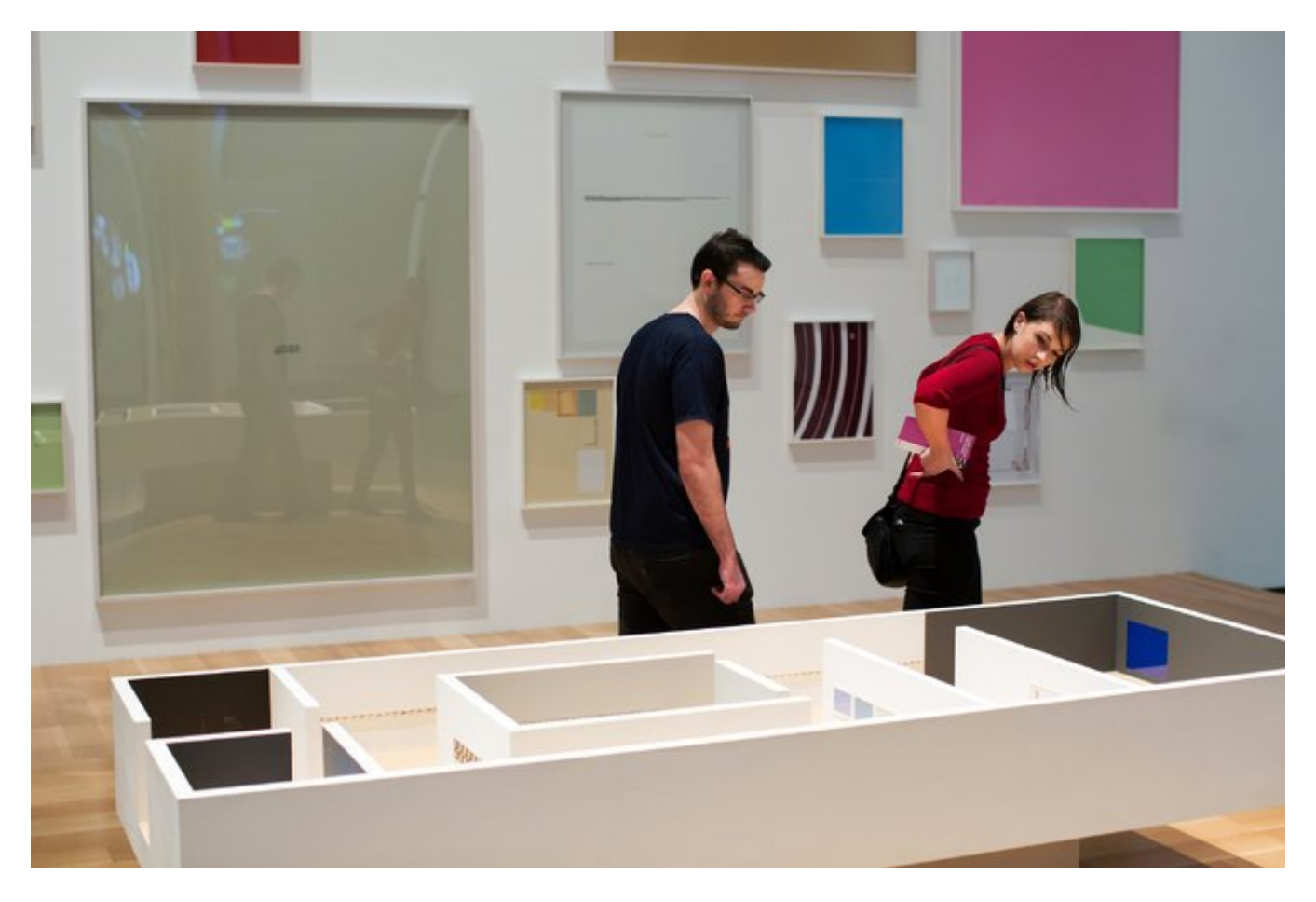
An installation view.