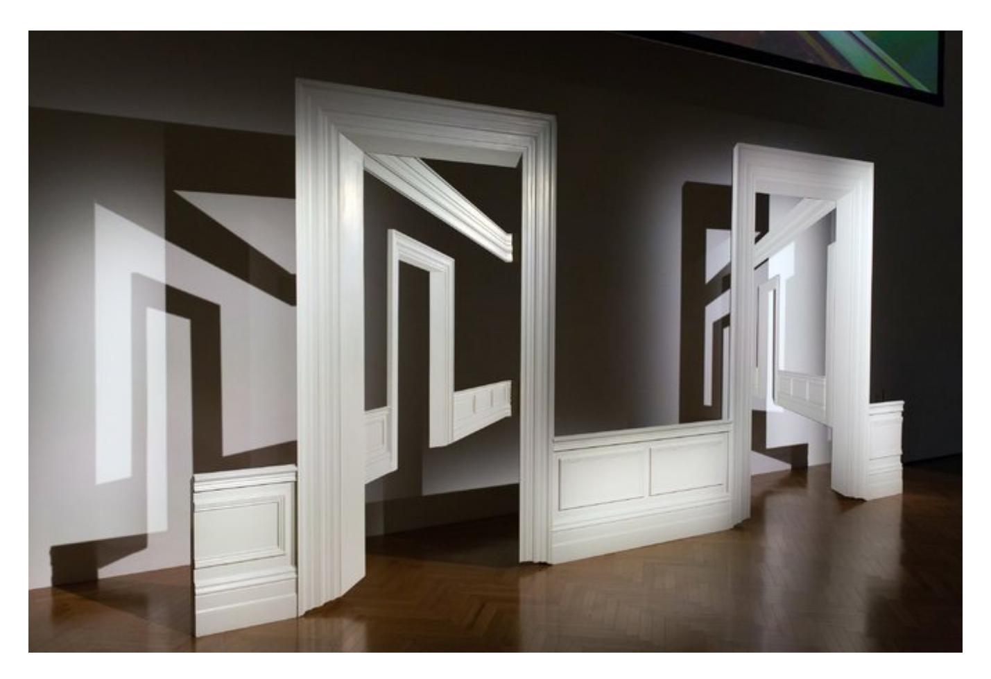
"Section 88_Act XXXI: Views from outer to inner compartments."

Titled "Walkthrough," it's the main component of a second long-term project, "Scratching on things I could disavow," begun in 2007. If the Atlas Group work is a 15-year meditation on localized past Middle Eastern wars, the newer project is a semifictional, semifactual look at the recent rise of an international market for historical "Islamic" art and contemporary "Arab" art. The market's most conspicuous manifestations are in the Arab world, with new museums going up and ambitious Western institutions, like the Guggenheim and the Louvre, pushing their brand abroad. All of this coincides with waves of political violence that have spread well beyond the Middle East, leaving the question open as to who really benefits from the new cultural entrepreneurship.