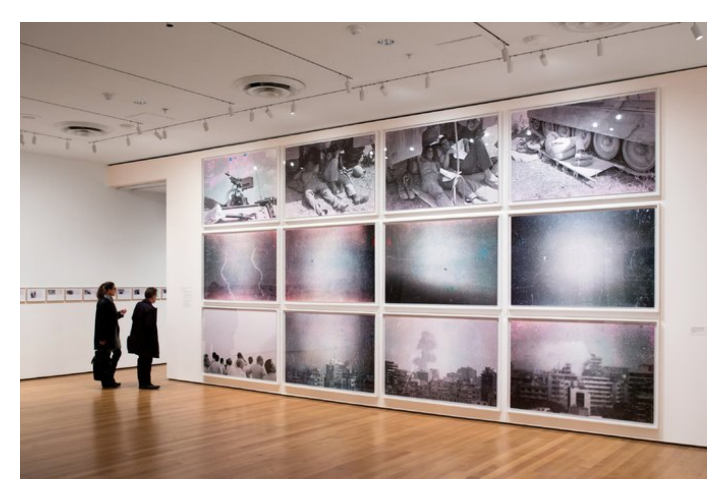
A grid of photographs makes up "We decided to let them say, 'we are convinced' twice. It was more convincing this way."