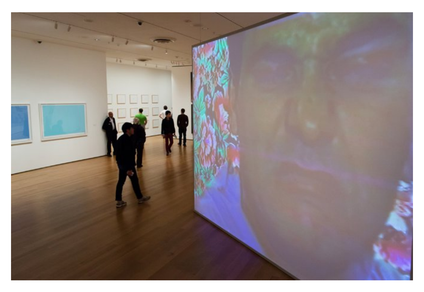
Part of a video installation titled "I only wish that I could weep."