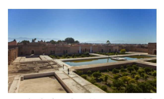
Marrakech Biennale 5, 2014. Venue: Palais Badil.

This was the starting point. Also, I did a lot of research in order to understand the position of Marrakech within the history of Morocco and the Maghreb. I made a reader for the artists as a basis to work with. The reader contained text and images of sites that were important for establishing Marrakech. Some of the artists chose to work within the context and some chose not to.