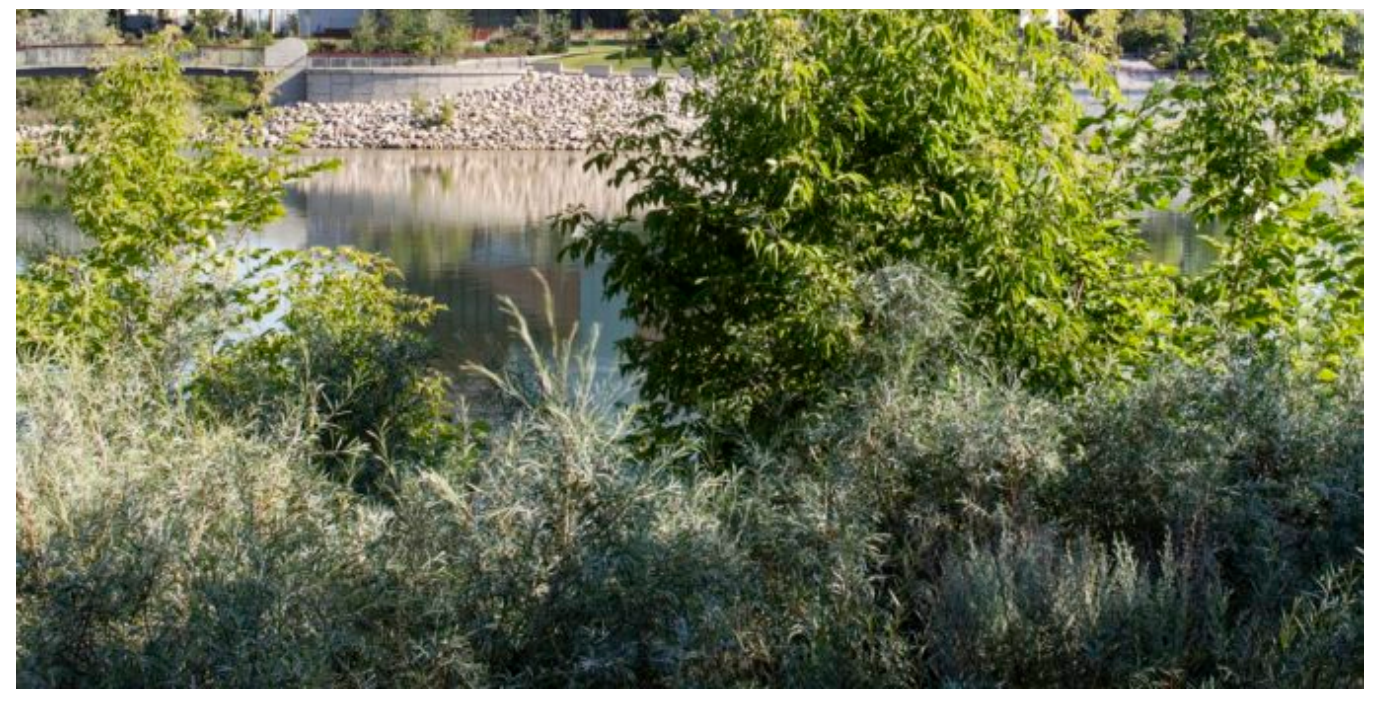
Remai Modern in Saskatoon, Canada.

Overall, the Remai Modern unites two major collections that do not necessarily appear connected or even complementary: that of the former Mandel Gallery in Saskatoon, which closed in 2015 and whose heavily regional art collection dates back to the start of the 20th century; and a recent gift from Ellen Remai, of 400 Picasso linocut portraits.