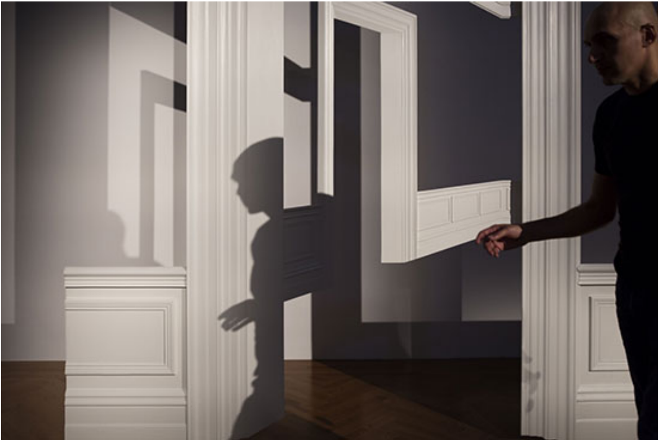
Walid Raad, Scratching on things I could disavow: Walkthrough , 2015.